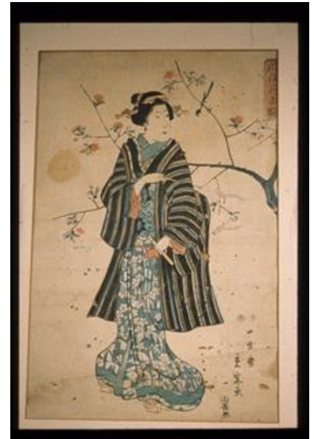
Block Prints of Lennox and Catherine Tierney Private Art Collection [002]: Geisha under Flowering Tree Lennox and Catherine Tierney Photograph Collection https://collections.lib.utah.edu/details?id=329534