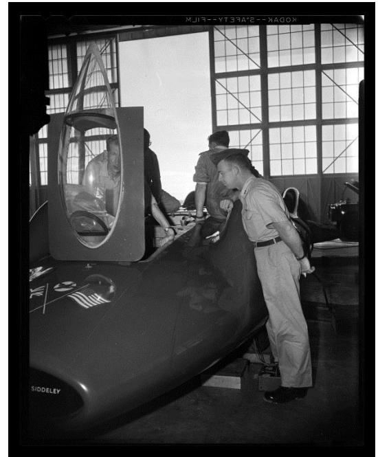
Campbell, Donald; Salt Flats – Shot 2 https://collections.lib.utah.edu/details?id=691545