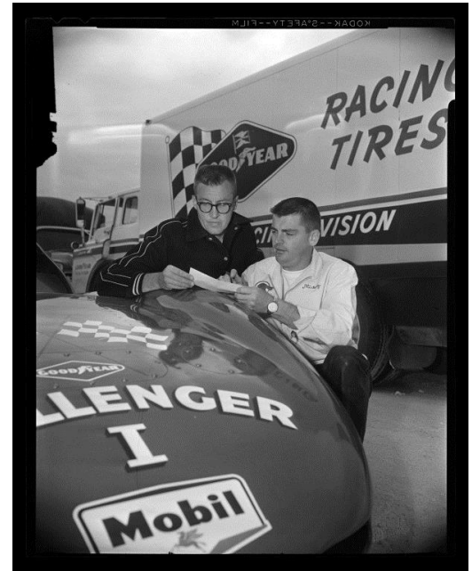
Thompson, Mickey; Salt Flats -Shot 11