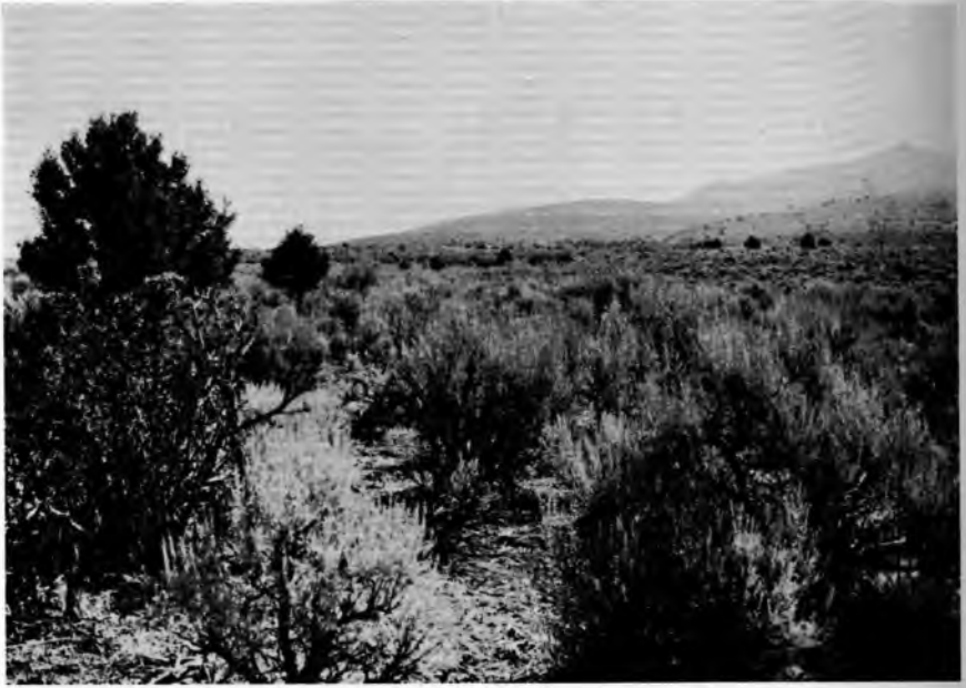
Fig. 8. Sagebrush and junipers near Mountain Meadows, 6500 feet. Birds breeding in the sagebrush areas were sage hens, sage thrashers, vesper sparrows, northern sage sparrows and Brewer sparrows.