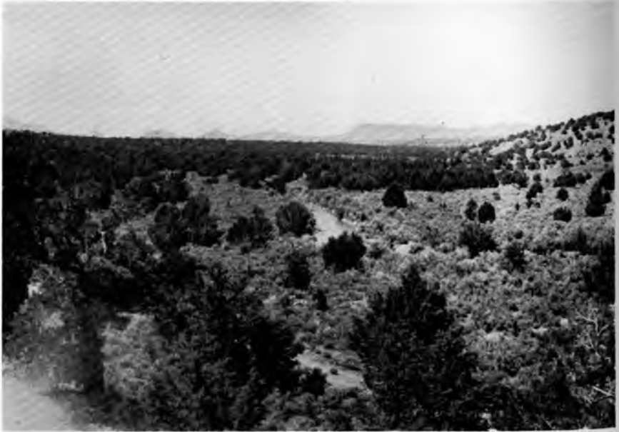
Fig. 9. Pygmy forest of pinon pines and junipers with sagebrush in intervening areas. This is the type locality of the gray titmouse. Species confined to the pygmy forest during the breeding season are the gray flycatcher, gray titmouse, lead-colored bush tit, pinon jay and black-throated gray warbler. Photographed June 14, 1938.