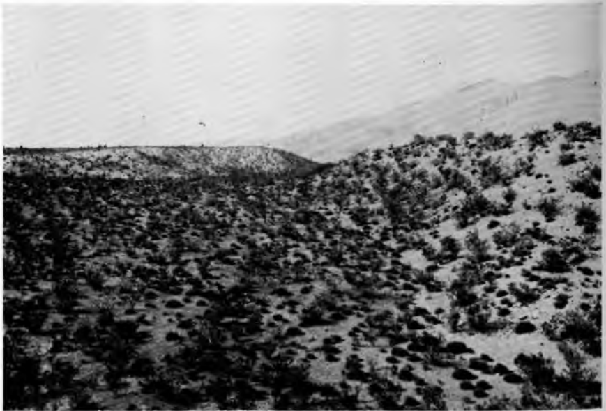
Fig. 5. A view of the creosote bush or covillea belt of southwestern Utah. Birds occurring in the belt during the breeding season were the Costa hummingbird, ash-throated flycatcher, Arizona verdin, Nevada shrike and desert black-throated sparrow.