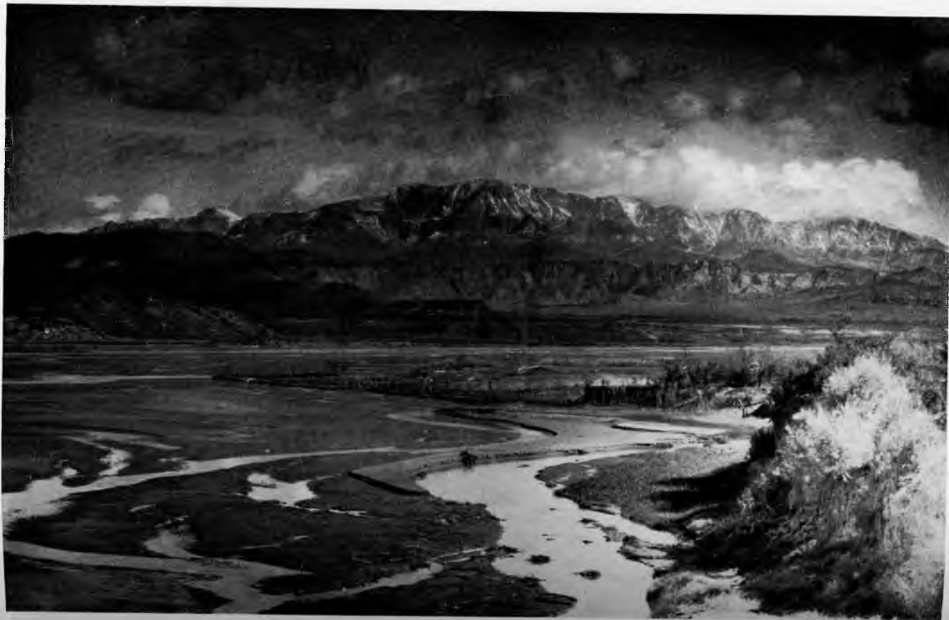
Fig. 1. The south face of the Pine Valley Mountains with the Virgin River in the foreground. The altitudinal range is from 2500 to 10,324 feet with the life zones extending from Lower Sonoran to Hudsonian.