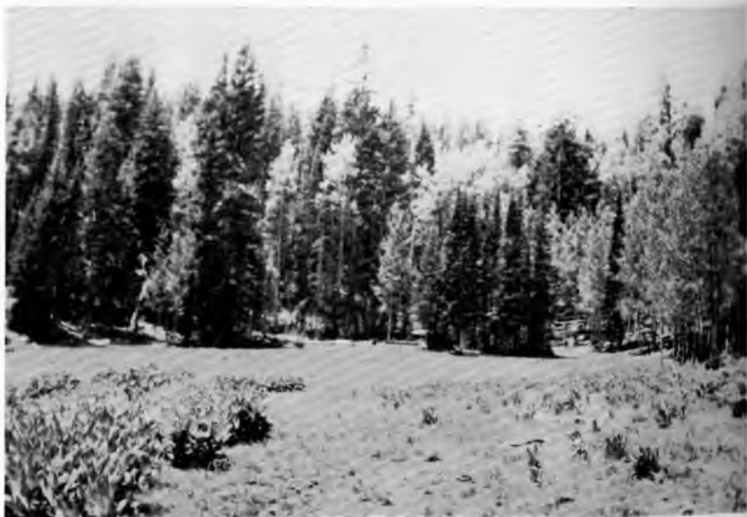
Fig. 13. Whipple Meadow, 8500 feet, Pine Valley Mountains. The forest in the background consists of aspens, spruces and firs. Some common breeding birds found here were broad-tailed hummingbirds, pallid Steller jays, Inyo chickadees, Audubon warblers, western warbling vireos, and gray-headed juncos. Photographed June 26, 1938.