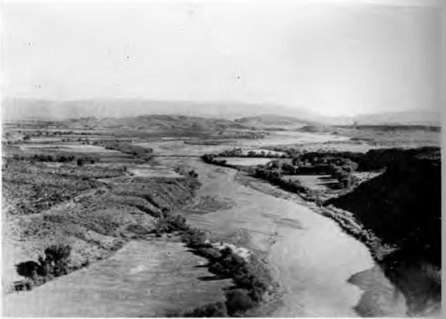
Fig. 2. The Virgin River and its valley looking downstream from Washington. Note the muddy water and exposed sand bars, which attract many transient shore birds, the willow thickets along the river margins and the scattered cottonwood groves.