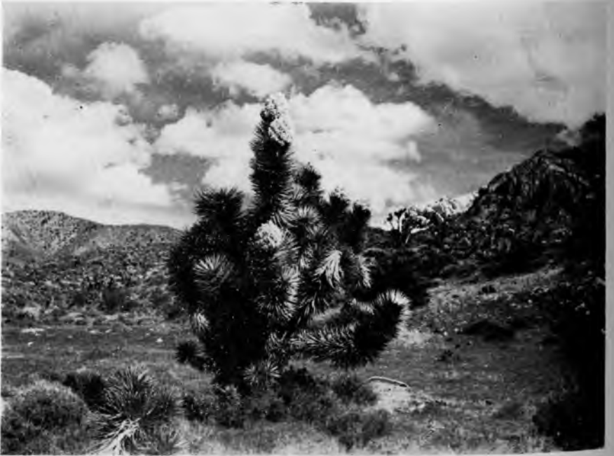
Fig. 7. West slope of the Beaver Dam Mountains, about 3500 feet, in the Joshua tree belt. In such a habitat the cactus woodpecker and Scott oriole were found.