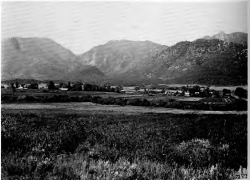
Fig. 11 The village of Pine Valley with part of the Pine Valley Mountains in the background. Habitats shown include cultivated fields, stream side thickets, cottonwoods, sagebrush, juniper-pinon forest on the lower mountain slopes and a spruce-fir forest above.