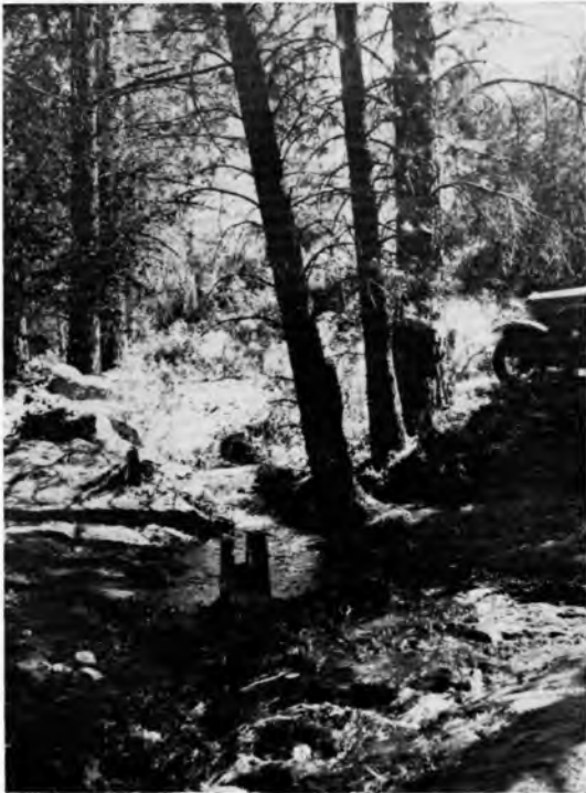
Fig. 10. Typical stream and yellow pine forest of the Pine Valley Mountains at 7500 feet. Among the breeding birds encountered in such a habitat were western wood peewees, Rocky Mountain nuthatches, black-eared nuthatches, western robins, Rocky Mountain black-headed grosbeaks, and gray-headed juncos.