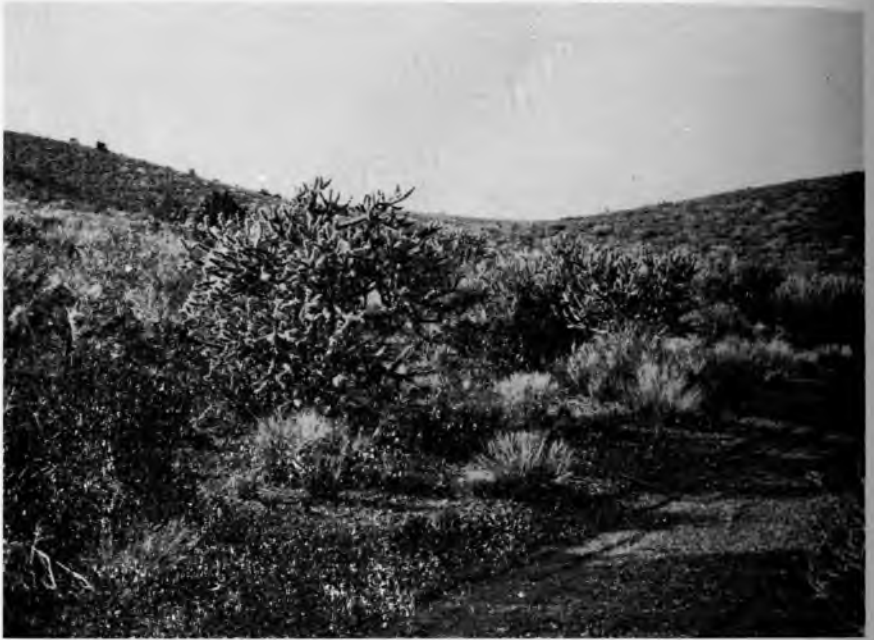
Fig. 6. Benchland along the Beaver Dam Wash in the Lower Sonoran zone. Cactus wrens used the cholla cactus bushes as nesting sites.