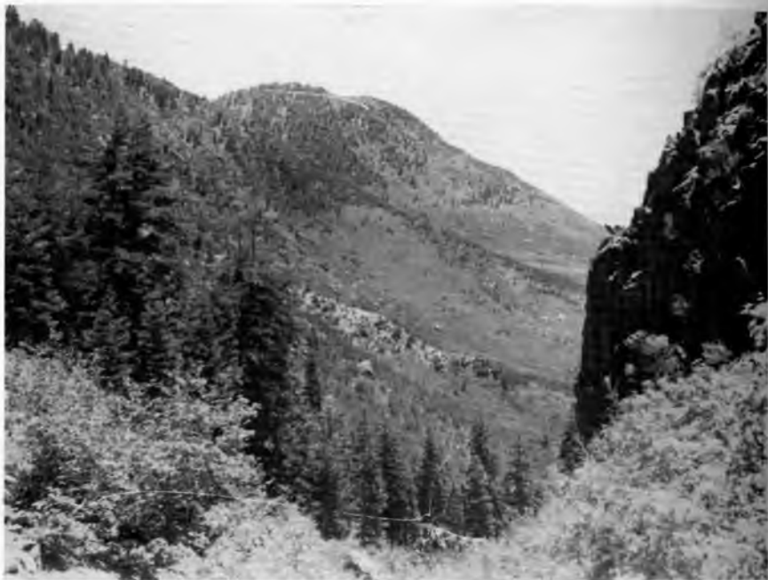
Fig. 12. The lower limits of the spruce-fir forest of the Pine Valley Mountains at 8000 feet. The vegetative belt below the conifers consisted mostly of Gambel oaks but in addition maples, mountain mahogany and manzanita.