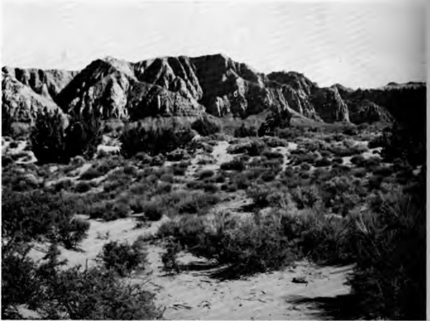
Fig. 4. Santa Clara bench with the red cliffs in the background. Here the junipers reached their lowest elevation at about 3200 feet. Among the breeding birds found on this bench were road-runners, western gnatcatchers, Nevada shrikes, Brewer sparrows and desert black-throated sparrows.