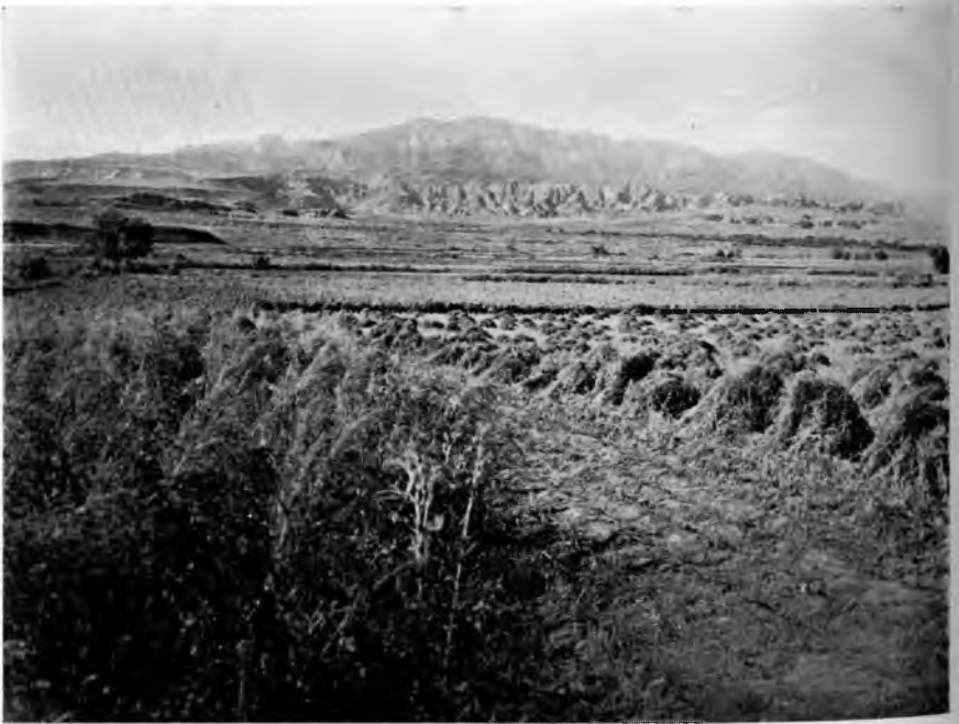
Fig. 3. View looking north across the Washington fields south of the Virgin River. The Pine Valley Mountains loom up in the background.