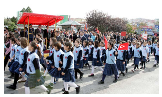
Picture 1: Elementary school students in the parade and the city officials are saluting them (29<sup>th</sup> October, 2011, Şile-İstanbul)

raising ceremony along with singing national anthem is still applied in all Turkish schools every Monday for opening and Friday for closing the ceremonies.