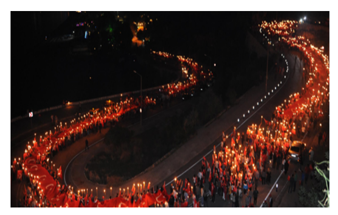
Picture 3: Evening light torch parade organized by people on Republic day (29th October, 2012, Antalya).

Celebrations in Schools: Students have always played a major role in the ceremonies of these national holidays as long as they are within the academic calendar. Other than the ceremony held by the state officials, every single school in Turkey is required to organize a ceremony in their schools to celebrate that day. The Ministry of National Education has a quideline that explains how the organization will be held. Thus, all ceremony programs are very similar in every school.