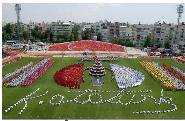
Picture 6: One of May 19<sup>th</sup> celebration in a stadium (place unknown, 2007).

This event always makes the evening news and broadcasted nationwide and even internationally. While