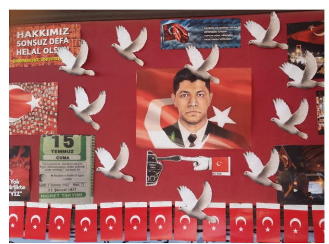
Picture 7: A Panel board created by Ataturk Elementary School students, Derik- Mardin [a Southeastern city] regarding 15<sup>th</sup> of July, 2016.

As can be seen from picture 7, in this board the central person is Ömer Halis Demir who was senior master sergeant on 15<sup>th</sup> July and he became a hero as he killed one of the top generals who were leading the coup attempt. Unfortunately, he also was killed by the other soldiers around the general. His action is considered as very important breaking point in preventing the coup as the general he killed was going to taking over the special army forces. His action is also very brave and heroic as he acted alone when he infiltrated into the coup forces and killed the general.