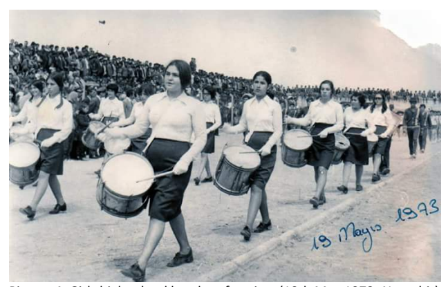
Picture 4: Girls high school band performing (19th May 1973 -Nevşehir)

have to be dressed up very neatly (Öztürkmen, 2001). Depending on the national day, students may have to wear a unique type of clothing. For example, male students have to wear shorts and shirt and female students have to wear skirt and shirt for the 19th May Commemoration of Atatürk, Youth, and Sports Fest so that they could do the sport activities and exercises. Usually Turkish literature, social studies, physical education, and music teachers take major roles in organizing these events. The ceremony always starts with minute of silence for remembering Atatürk, his comrades and who-ever lost his life saving this country. Just after this minute ends, all crowds sing the national anthem . Then, the host - usually the Turkish teacher - shout "at-ease" so that students can put their hand behind their back and move their right leg to the right side for 30-40 cm which is what the soldiers do in the training.