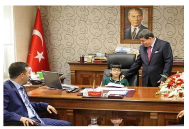
Picture 5: Elementary school students visiting the city governor (23th April, 2016- Antakya) [a city at the South of Turkey].

Another noteworthy tradition of the children day is that selected students assume the role of president, prime minister and other ministers for one day. In fact, these selected students get to sit on the real chair of this high level official. While this is merely a symbolic gesture for a very few students, it is also a tradition for selected students from every school to visit the city governor, mayor and other high level state officials that day (see picture 5).