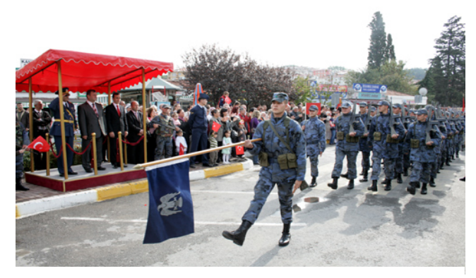
Picture 2: Soldiers in the parade and the city officials are saluting them (29th October, 2011, Şile-İstanbul).

There always have been two different venues in which these days are celebrated. The first is the celebration organized by the state officials and the latter is the ceremonies organized in each and every school in Turkey. Both ceremonies have something in common while there are some distinctions. Both ceremonies have not changed much and been repeated every year with very similar fashion. We will give the details about the celebration procedures below.