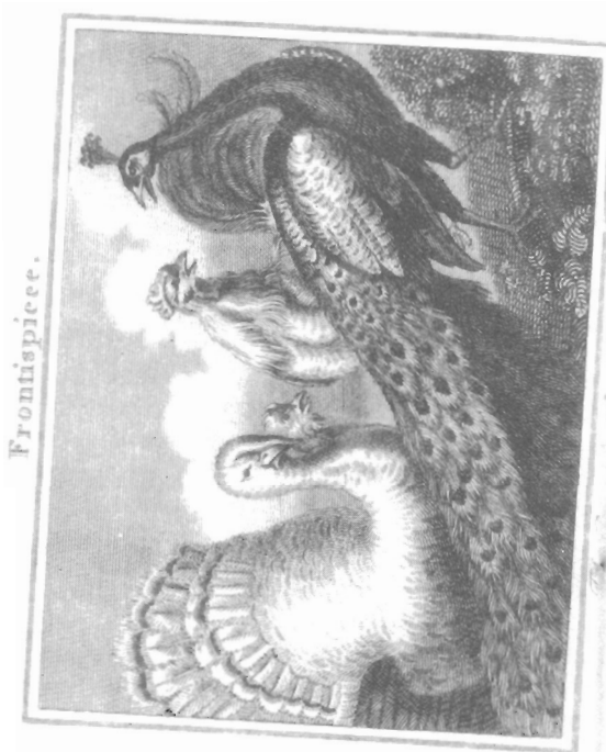
Figure 1. An early chapbook edition of Butterfly's Ball and Grasshopper's Feast . London: Dean and Munday, [ca. 1815]. By William Roscoe.

THE PEACOCK "AT HOME: SEQUEL TO THE BUTTERFLY'S BALL. WRITTEN BY A LADY. AND ILLUSTRATED WITH ELEGANT ENGRAVINGS. LONDON: PRINTED FOR J. HARRIS, SUCCESSOR TO E. NEWBERRY AT THE ORIGINAL JUVENILE LIBRARY, THE CORNER OF 21, PAUC'S CHURCH-YARD. 1808.