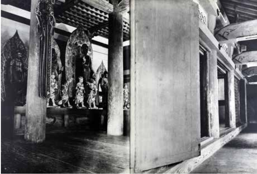
Figure 3. Domon Ken. Murōji , 1954, pp. 18–19. Reproduced with permission of the Domon Ken Museum of Photography.