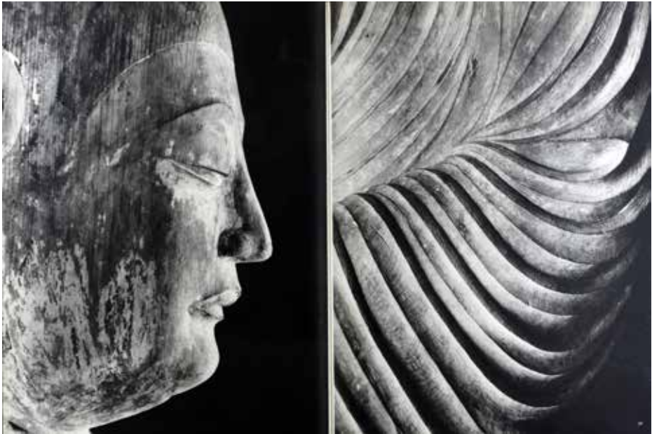
Figure 5. Domon Ken. Murōji , 1954, pp. 36–37.