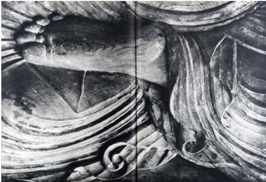
Figure 7. Domon Ken. Murōji , 1954, pp. 40–41.