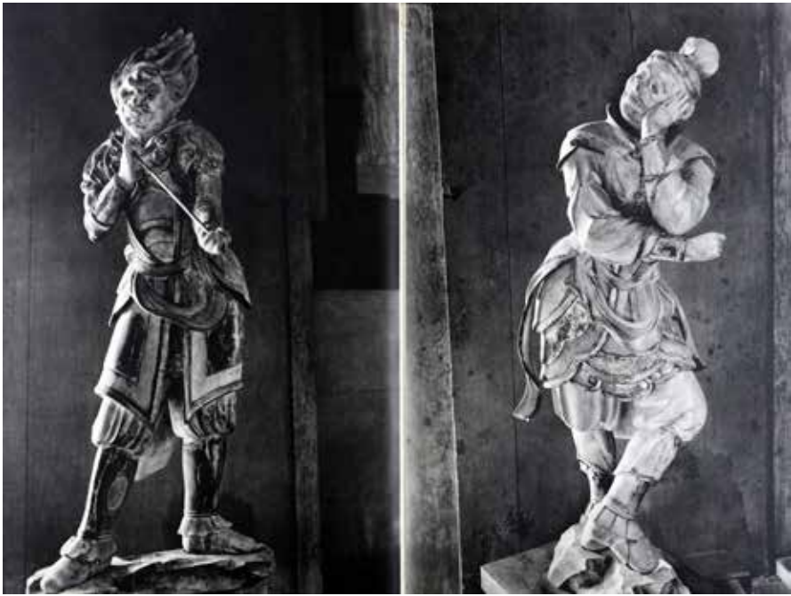
Figure 4. Domon Ken. Murōji , 1954, pp. 30–31. Reproduced with permission of the Domon Ken Museum of Photography.