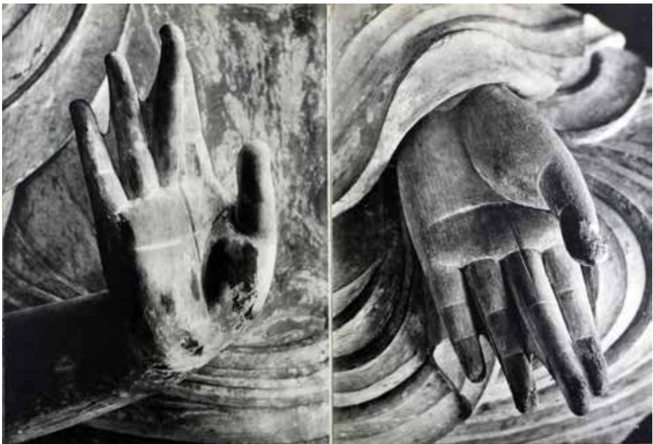
Figure 6. Domon Ken. Murōji , 1954, pp. 38–39.