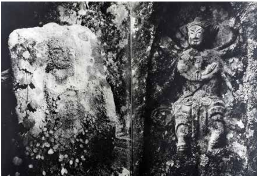
Figure 8. Domon Ken. Murōji , 1954, pp. 48–49. Reproduced with permission of the Domon Ken Museum of Photography.