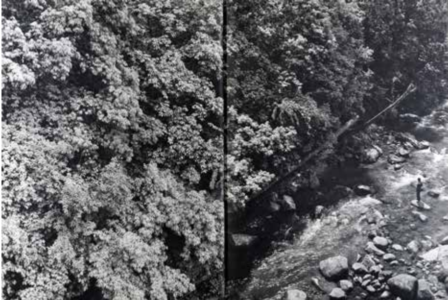
Figure 1. Domon Ken. Murōji , 1954, pp. 10–11. Reproduced with permission of the Domon Ken Museum of Photography.