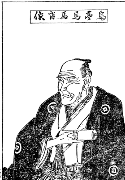
Figure 4. Utei Enba. From Shin zōho ukiyo-e ruikō 新增補浮世絵類考 (completed 1868).

[Ihara] Saikaku thoroughly read and digested many old narratives and put them to use when writing of his times. As a consequence, his diction is elevated. The felicitous phrases that [Ejima] Kiseki used throughout his life are all lifted from Saikaku. In his writing, Saikaku was a master at using the syllable “ te ” and the suffix “ keru .” 67 When I wrote my five-volume Mizu no yukue , I imitated Saikaku’s style.