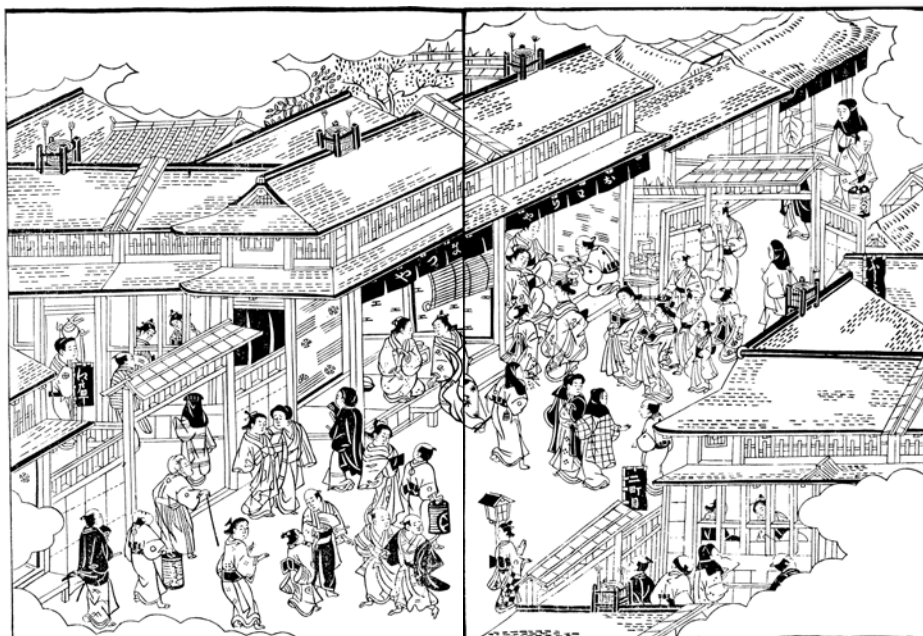
Figure 2. Naka-no-chō in Yoshiwara during the mid-eighteenth century. In the right panel (center left) stands the Owariya, and next to it the Matsuya (left panel, center right). Fushimi-chō is located to the right; the entrance to Edo-chō is visible in the left panel. From Ehon Edo miyage 絵本江戸土産, vol. 1 (1753) illustrated by Suzuki Harunobu 鈴木春信 (1725–1770).

but time and again I received a gratuity from the guests. On one occasion, important visitors arrived and I worked in the parlor well into the night. The next day I looked to see what I had been awarded and discovered that it was more than forty ryō ! I did not own as much as a change of clothes, but my bedclothes were of silk and so was my futon. In the old days when we received a windfall, we purchased that sort of thing.”