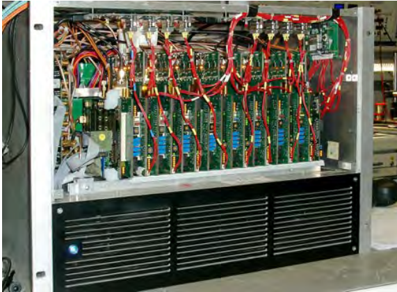
Fig. 1: DBBC3 VGOS model: 8 IFs with 8 groups of ADB3 samplers and CORE3 processing boards. This unit can deliver 128 Gbps with 2-bit samples (output limit is 512 Gbps).

avenue to observations with data-rates up to 32 Gbps, possible with EVN's widest IFs at higher frequencies.