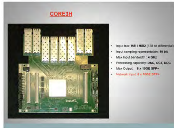
Fig. 3: The FPGA processing board CORE3H can be populated with up to eight optical transceivers. They can work as output (standard DBBC3 VDIF streams for recording) and as input to the FPGA (application for “digital” receivers).

It is worth noting that if required, there could be full compatibility with a standard DBBC3 equipped with ADB3L sampler boards to be compatible with traditional receivers whose analogue signal is sampled in the backend. Indeed switching between input data to the CORE3H boards coming from the local ADB3L or