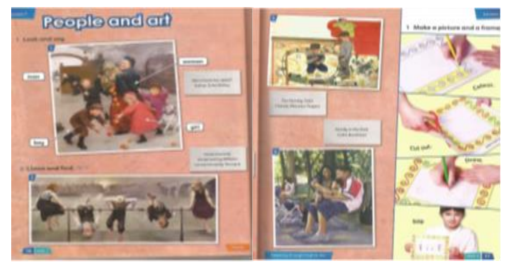
Figure 03. Incredible English 1, Oxford, pp.16-17, "People and Art" ("The school show" unit).

The phenomenon to extend the topic of learning is depicted in Figure 2. The images enhance the meaning of the words exposed in bubbles by conditions, space and manner<sup>25</sup>. Finally, a set of results gathered is outstanding because of the CLIL sections here that teach art through English is introduced as it is depicted in Figure 3 below.