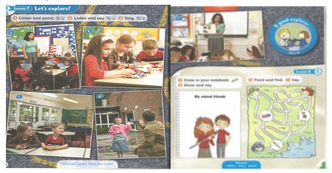
Figure 01. Oxford Explorers 1, Oxford, pp.10-11, "Let's explore!" from "School unit"

The detailed analysis of the cultural content resulted in very interesting data. The image-language relationship provided understandings into the construction of the input offered for YLs. These are multimodal texts with the model sections. The sections vary in terms of images (simple or complex) and texts. For the purpose of this study, the results are classified in two categories: the expansion and projection of meanings. The expansion of meanings involves the subcategory of concurrence, complementarity and enhancement. A sample of the concurrence can be found in this research as presented in Figure 1 below.