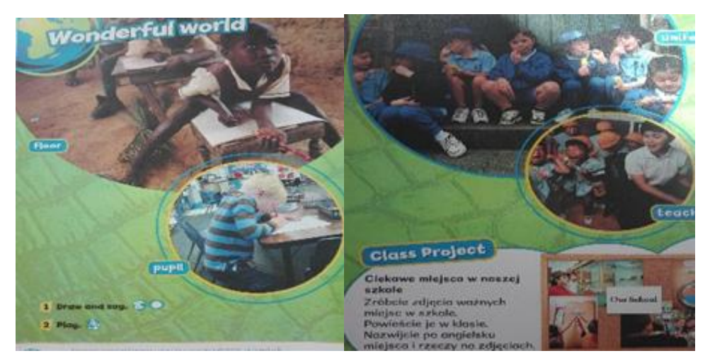
Figure 02. My World 1, Nowa Era, pp.24-25, "Wonderful World" from "School unit"

In figure 1 the relationship between the image and language is classified as expansion and concurrence – precisely exemplification<sup>24</sup>. Another set of pages in the image-text relationship is the expansion and enhancement of meanings concerned with the international and home culture as is presented in Figure 2 below.