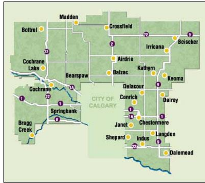
Figure 2: Rocky View County.