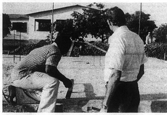
Arkansas Baptists are joining hands with their Brazilian brothers and sisters in Christ to further the kingdom of God in two Brazilian Baptist conventions through Brazil-Arkansas Partnership Mission Projects. (Left) The first partnership project added a 100-bed dormitory to a Baptist encampment at Sao Luis in the Maranhao Convention.

few tools with them, the team worked mostly with the tools available, many of them handmade. At first, they mixed concrete by hand. In addition, most of them found themselves tackling tasks in which they had little or no experience.