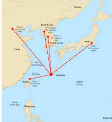
Figure 1. Okinawa's Strategic Location (U.S. State Department, 2009)

Overall, MCB Camp Foster was chosen because of the diverse active duty Marine population aboard the installation. Marines aboard this installation are in close proximity to establishments, activities, and sources of information regarding social events that Marines aboard the northern camps are not privileged to have because of their isolation and operational tempo. Furthermore, there is a plethora of different occupational specialties, and cultural and ethnic diversification, that make this population pool a great representation of the overall Marine Corps. Additionally, the author has a rapport with installation leadership, built over the years, and a well-established goal of conducting research within the military community to address social and psychological concerns in an attempt to minimize harm while improving operational readiness. Pre-coordination has been made with the Camp Commander of MCB Camp Foster to access information through the Freedom of Information Act (FOIA) from the Substance Use Center, the Provost Marshall's Office (PMO), and the Installation's Legal Center that was submitted and approved on 18 December 2018