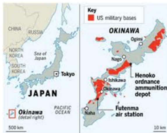
Figure 2. Okinawa's Military Base Land Allocation (MCIPAC G-3/5, 2018)