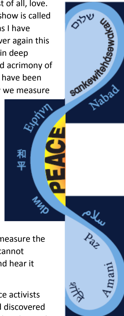
New sign on front of Wilson Center says Peace in 11 languages