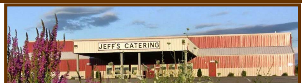
Jeff's Catering, Brewer Maine will host the Annual Meeting & our Log A Load for Kids Fundraiser.