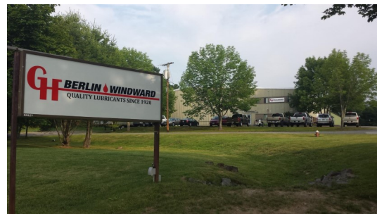
GH Berlin-Windward Westbrook, ME facility