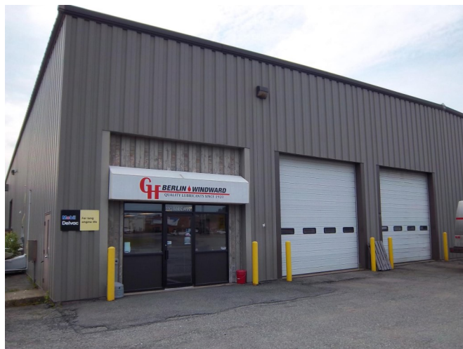
GH Berlin-Windward Hampden, ME facility

customers up and running. GH Berlin-Windward’s service and quality capabilities are only overshadowed by the great depth and knowledge our employees have. Many GH Berlin-Windward staff members have over 30 years of lubricant handling and application expertise.”