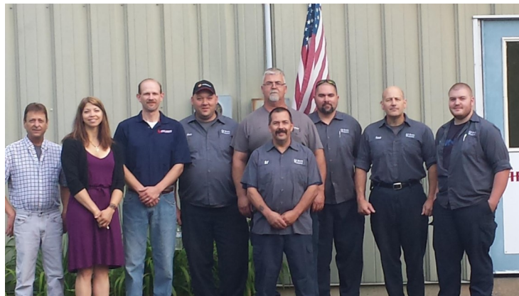
GH Berlin-Windward Westbrook facility employees

GH Berlin-Windward has a very broad, comprehensive lubricant, diesel exhaust fluid, and ancillary product portfolio. The company carries more than 5,000 items, including major lubricant brands Mobil, Chevron, and Shell.