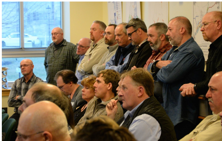
PLC Members attend a legislative presentation on biomass in February. Such strong shows of support have had an impact on the biomass debate.

On March 28 a public hearing on LD 1676, "An Act To Establish a Process for Procurement of Renewable Resources," was held in Augusta and attended by dozens of professional loggers and supporters who made a strong case for passage of the bill, but which also revealed strong opposition to the rate increases it would mean.