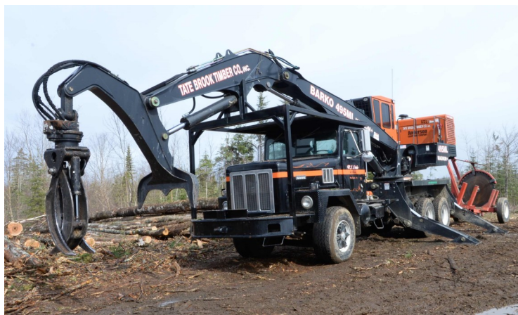
Tate Brook Timber Co. Barko crane with slasher