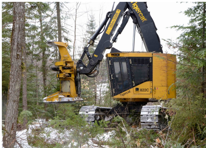
Tate Brook Timber Co. Tigercat 822c in action