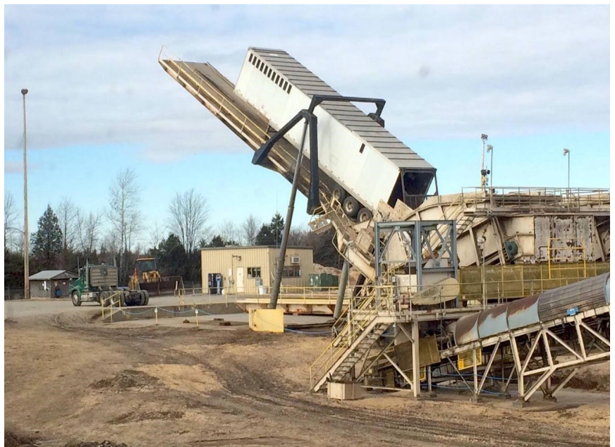
SAD DAY: Photo from Treeline Inc. of their last scheduled load hauled to Covanta's West Enfield facility in early March. This photograph, and accompanying text from Whitney Souers, drew some of the highest numbers the PLC Facebook site has seen in 2016, and many messages of support.

Loss of the state biomass market would also lead to an environmental issue of uncertain proportions as wood waste from sawmills, logging, and other operations piles up and needs to be disposed of in