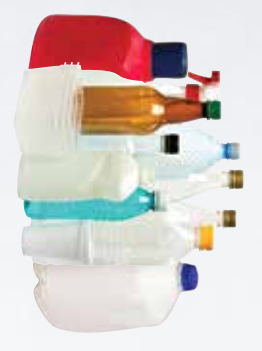
Plastic Containers (#1-#7)