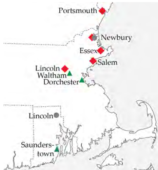
Figure 1: Test Locations

External pressure taps were split with a tee and located a minimum of 5m from the testing door, near the midpoints of two walls to balance local pressure differentials. Internal readings were taken at the gauge. All tubes were checked for leaks with the manometer, and manufacturer-recommended field calibrations conducted at the start of each test. Baseline pressure corrections were taken for a minimum of 60 seconds, and retaken whenever testing was interrupted. After stabilization, pressure and flow measurements were recorded with time-averaging of at least 5 seconds, and up to 60 seconds on windy days. A Kestrel 3500 pocket weather station, with a 0.1°C resolution, and \pm 0.5^\circ\text{C} accuracy, was used to record indoor and outdoor temperatures.