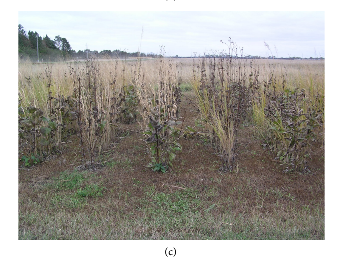
Figure 1. (a) Monocultures of prairie cordgrass (left 3 rows) and cup plant (right 3 rows); (b) Monocultures of switchgrass (left 2 rows) and prairie cordgrass (right 2 rows); (c) Binary mixtures of cup plant/switchgrass (left 3 rows) and cup plant/prairie cordgrass (right 2 rows). Photos taken on 20 November 2013 at Brookings, SD. Experiments were established from transplanted seedlings in June 2011.