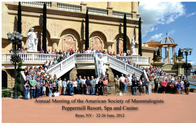
Fig. 3. —Group photograph of the attendees of the 92nd Annual Meeting of the American Society of Mammalogists in Reno, Nevada, June 2012.

In recent years, a number of innovations were introduced to the Annual Meetings, including pre-meeting workshops and additional funds provided as travel grants to students (in the 2020 budget some $150,000 was provided for student travel and research awards).