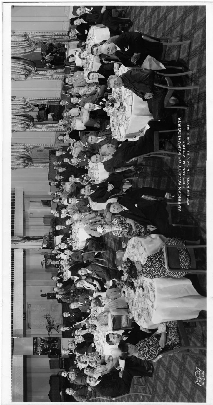
Fig. 4. —Evening banquet at the 23rd Annual Meeting of the American Society of Mammalogists in Chicago, Illinois, June 1941. This is a typical banquet of the era. Note the lack of younger members in attendance.