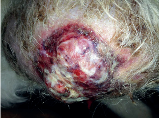
Figure 2. Mass at the right elbow of a thirteen-year-old, male, castrated crossbreed dog.