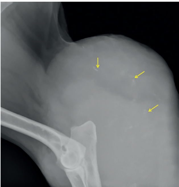
Figure 3. Right-left lateral projection of the right elbow. A large soft tissue swelling containing mineralized opacities (arrows), centered on the caudal aspect of the elbow is present.