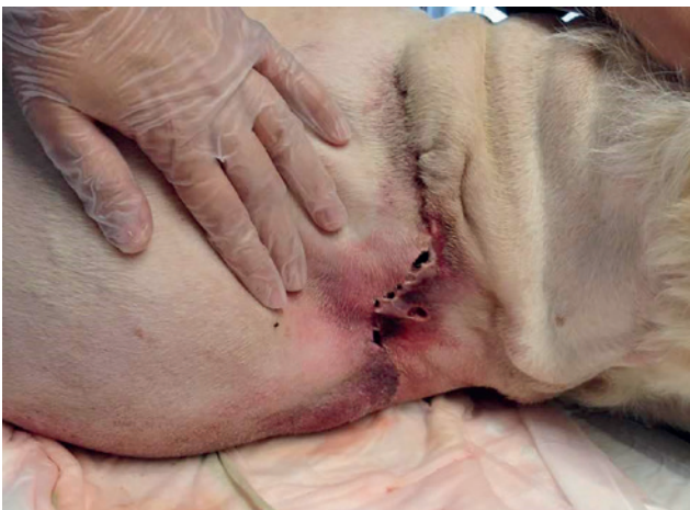
Figure 4. Wound dehiscence in case 2, four days post-operatively.

coli ). Antimicrobial therapy was changed to amoxicillin clavulanic acid, based on the antibiogram (Kesium, Ceva Santé Animale B.V., Brussels, Belgium, 12.5 mg/kg orally twice daily). Delayed primary wound closure was performed after resection of the wound edges and curettage of the wound bed six days after wound dehiscence. Antimicrobial therapy was continued for another ten days; the wound healed without further complications.