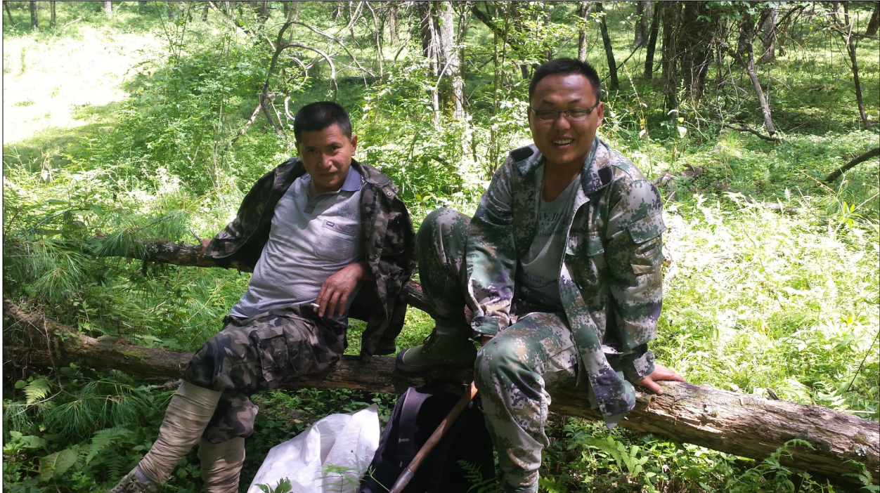
Figure 1: A local expert guide and a masters student take a break after completing a vegetation survey in Sichuan Province, China.

field assistants' participation in research beyond providing data. First, the current data landscape in biodiversity conservation is described using the existing literature. Qualitative data from informal interviews with several conservation professionals on the topic of data in biodiversity research are then reported. Finally, this information is synthesized to design more inclusive data practices and provide recommendations for improving the engagement of local field assistants, and their communities, with biodiversity research.