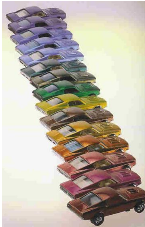
Figure 1: “Cool” Rainbow Cars 9

Michael Benedikt suggests that the beginnings of a style which heralded the computer age had begun to crystallise around a ‘vocabulary of lightness’. 10 1950s and 60s architecture seized upon ‘high-tensile steels, glass, walls reduced to reflective skins, openness, and chromium’ and, by the late 1960s, included the ‘dream of [...] buildings like giant posters bedecked in neons’ and transparent to the communications signals of radio, television, and telephones. 11 These are exactly the qualities which characterise the Hot Wheels cars: metal, gloss, neon. The cars were also soon sporting, like neon billboards shrunk to size, colorful, cartoon-like tampos—angled geometrics, flames in red, silver and black, skulls and crossbones, flaming eyeballs. The entire aesthetic spoke to two primary and related principles: tactility and movement.