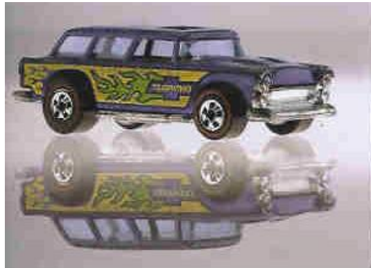
Figure 2: Collectors' Guide: Style 15

It is thus entirely fitting that the Hot Wheels brand has insisted on a signature art and photography style that speaks to the intangible. Official Hot Wheels collector guides simultaneously advertise current models available for purchase and foreground the cars' aesthetic. The guides typically feature a single car on each page, framed by a rectangular border and photographed against a white or silver background that maximises the car's reflection (Figure 2, below). The borders lend the images a portrait-like quality and emphasise a full two degrees of separation from an original—the toy itself as a representation of an automobile (one degree) and the image or portrait of the toy (two degrees). We might add a third degree, since each car appears twice in the images—once as the apparently material subject of the photo, and again as an immaterial reflection. The cars are consistently accompanied by these intangible doubles which flow, like electricity, into and across the negative space of the photograph, reinforcing the intimation of the cars' design: Hot Wheels transcends limits and crosses boundaries.