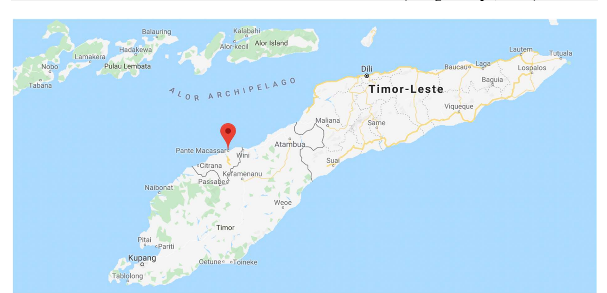
<u>Figure 1</u>: Island of Timor, showing Oecusse (tagged), which occupies the same territorial area as that claimed for the Sultanate of Occussi-Ambeno. (Google Maps, 2019).