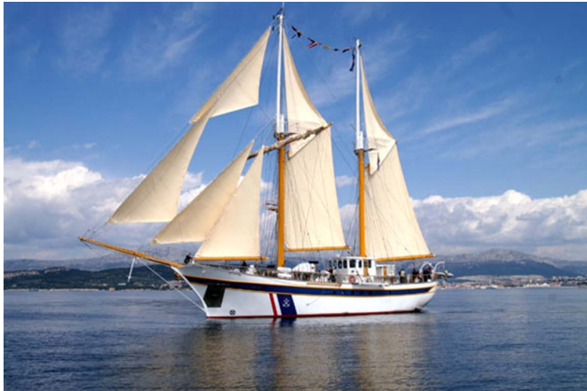
Figure 1 Training and research ship Kraljica mora .