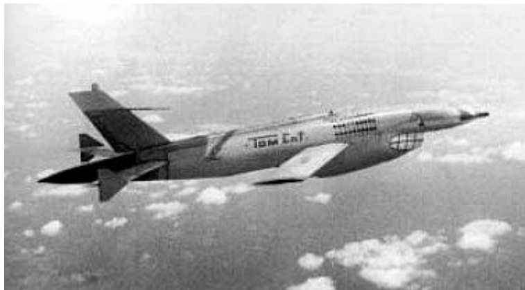
Figure 4. Ryan Model-147 UAV

All together the Ryan Aeronautical made 28 modifications of the Model-147 UAV. The new drones’ tasks included day-and-night photographing, electronic detection, jamming, deception and spreading leaflets. The fast reaction was delayed by the fact, that information gathered with this could be analysed after the UAV’s return. By 1972 it was even possible to broadcast the data live to the ground station. The Ryan Model 147-SC was equipped with TV camera and datalink system. The Ryan Model 147N could amplify its radar signals, so it was detected as it was a much larger target [13]. From 1972 the UAVs joined the propaganda warfare by spreading leaflets, because the conventional airplanes had suffered serious damage during these missions.