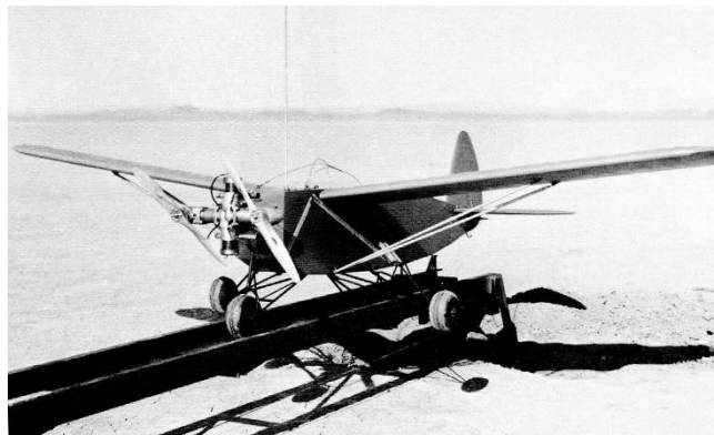
Figure 2. A Radio Plane on the ramp ready for departure

After the outbreak of the Second World War, the militaries' demand for Pilotless Target Vehicles started to grow rapidly. That's why the Radio Plane, [Figure 2] codenamed OQ-2 was created in the US by Reginald Denny. It was a monoplane made of wood and propelled by an aircrew. The UAV could land with the help of a parachute if the datalink was lost for some reason, a function that proves it to be a relatively developed model. Furthermore it was able to take off from its landing gears on an ordinary runway. In contrast with the earlier UAVs, damaging could be avoided because of these features.