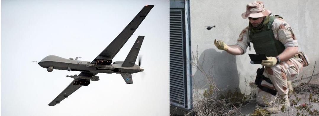
Figure 6-7. A British Reaper operating over Afghanistan in 2009 and a Black Hornet Nano

on the ground with local situational awareness. They are small enough to fit in one hand and weigh just over 16 g, including batteries. An operator can be trained to operate the Black Hornet in as little as 20 minutes. The UAV is equipped with a camera, which gives the operator full-motion video and still images.