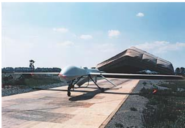
Figure 5. A Predator UAV in Taszár, Hungary, during the Yugoslav War

turned out that drones can be used in many ways in almost every combat theatre, and they are extremely effective [13].