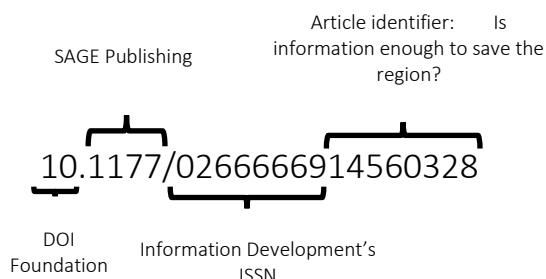
Figure 2. Anatomy of a DOI

The final process performed with the DOI was to sum downloads of each different document. This determined that the 3.5 million regional downloads of the period corresponded to 2,093,371 different papers, ranging from one to 366 downloads each; so this allowed determining total downloads of each different document. Table 3 shows the ten most downloaded in the period. Eight of these are from the field of medicine, one from chemistry and one from biology. They were published in The New England Journal of Medicine (4), The Journal of the American Medical Association (2), Concepts in Magnetic Resonance (1), Journal of Bacteriology (1), Nature Reviews Microbiology (1), and The Lancet (1). The New England Journal of Medicine is among the most downloaded journals, although it offers its articles for free after a six-month embargo. Interestingly, none of these 'Top 10' documents are in the similar list compiled by Bohannon (2016), which has four papers related to Medicine, while the rest are from Engineering, Physics and Biology.