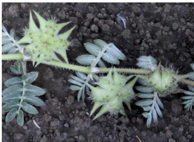
Figure 1. Underside of puncturevine hairy leaflets, stems, and fruit.

Puncturevine is a prostrate-growing annual plant that is particularly undesirable because it produces a spiny fruit that can injure animals and flatten tires. It can also be toxic to livestock and is difficult to control due to continual germination throughout the summer.