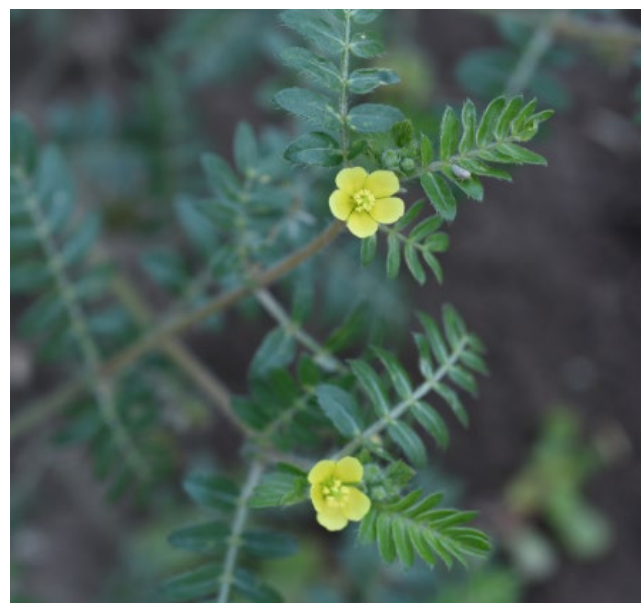
Figure 2. Yellow puncturevine flowers grow on the node in between leaf pairs.