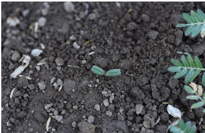
Figure 4. Puncturevine seedling emerging from the soil.

Biocontrol and mechanical control methods are summarized in Table 1.