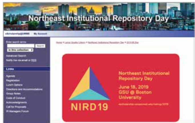
Figure 1. The Northeast Institutional Repository Day website https://escholarship.umassmed.edu/neirug/2019/

To make this event meaningful to our local IR community, we asked survey respondents to identify the pressing issues or questions they face in their day-to-day work. We received 89 unique responses to this question. The responses were so varied and specific that it is difficult to point to obvious trends among our survey respondents. However, multiple users mentioned an interest in community-owned or community-built infrastructure, a need for which came crashing to the forefront of repository administrator conversations after Elsevier's acquisition of bepress in August 2017.