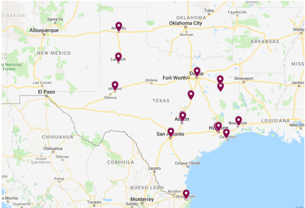
Nonprofit Management Alliance of Texas Member Locations Map

The Nonprofit Management Alliance of Texas (NMAT) is a network of nonprofits whose primary mission or program focus is to strengthen the ability of nonprofits to achieve their mission (OneStar Foundation, 2019). NMAT was formed following a multi-year study done at the Bush School at Texas A&M University that revealed a need for more formal networks and alliances to increase coordination and communication across the nonprofit center.