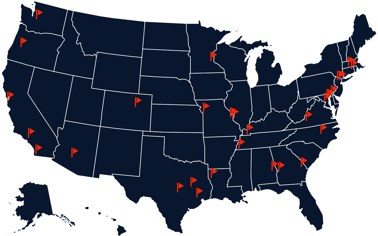
NACC Member Locations in the United States

Amongst the 67 academic nonprofit centers studied, 51 centers were members of the Nonprofit Academic Centers Council (NACC) .