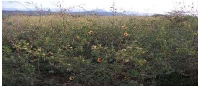
Fig. 7 Widespread invasive species in the Nech Sar grassland plains

While there is deforestation, overgrazing and over-utilization of resources undertaken on fragile ecosystems coupled with the current climate change, fertile grounds will be created for easily spreading invasive species which totally distress and dominate the existing natural ecosystem. Currently, there are many invasive species that are increasingly spreading around NSNP which have a negative impact on the sustainable use and conservations of the park. Conservation of the natural ecosystems is the primary means to control the expansion of invasive species and regulating the ecosystem dynamics.