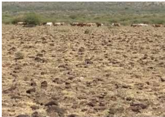
Fig.8 Habitat Destruction

The natural forest and wood lands are the habitats of important large and small animals. In NSNP, we find different animals: Zebra, Grant’s Gazelle, Kudu and Lion. Despite the living space, the provision of food and water for these animals and birds, is the other extremely important aspect in a forest and woodland (Lemlem & Fasil, 2006). However their habitat is currently being destroyed by the over-grazing of cattle and rapid deforestation for different purposes (Desallegn, 2004; Freeman, 2006; NSNP report, 2010 cited in Samson, et al., 2010).