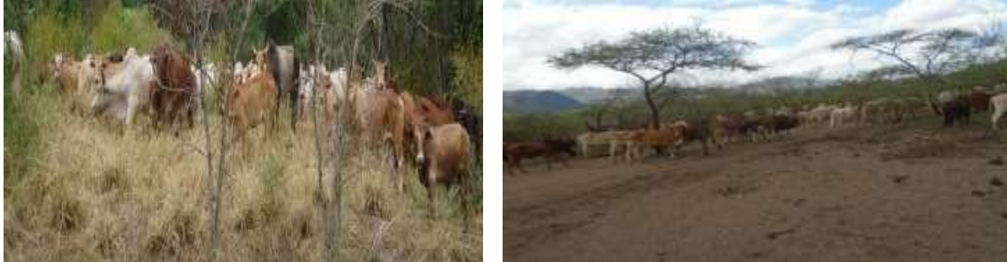
Fig.5 Encroachment of grazing land to forest areas

the relative carrying capacity of the grassland, which causes degradation. Thus, the overcrowded livestock creates direct pressure on the forest and wetland and destroys the environment totally (Freeman, 2006). In conclusion, the use of the park as primary source of animal grazing land and over consumption of the grass will have sizable impacts on the wild life in particular, and this may ultimately exert its influence on sustainability of the park in general.