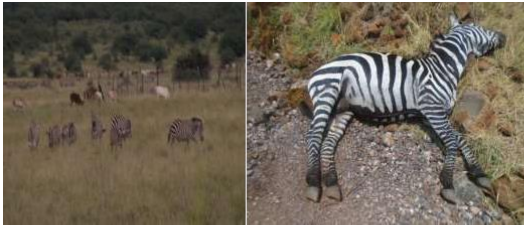
Fig. 9 Sharing of grazing land between the wild and domestic animals (left) and death of zebra by transmitted diseases (right)

revealed that wild animal migration as result of habitat destruction, is the greatest problem of the park. Many important fish, birds, and small and big mammals that live in the park ecosystem are being affected and their reproduction rate has also been critically disturbed.