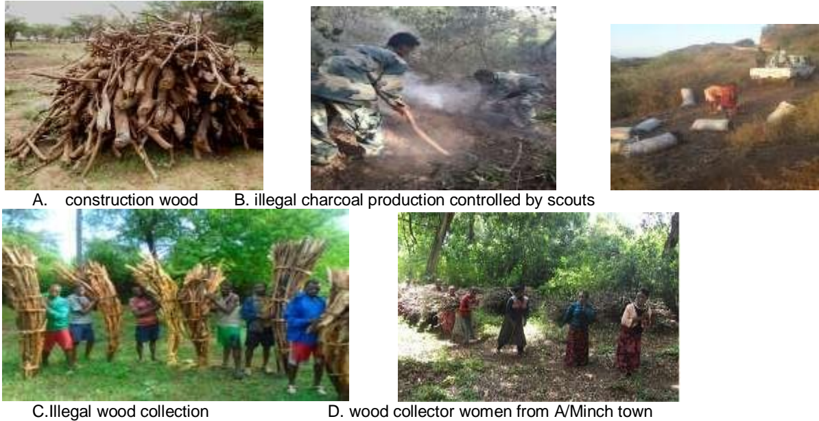
Fig.4 Wood collection for different purposes

natural forest which results in the loss of 12.5 hectares of forest per year( discussion with park manager, June, 2018). Moreover, Aramde et al., (2012) reported that on average, 147 people enter in NSNP per day and of these people are the highest number engaged in the collection of wood for fuel, with a total share of 58%, followed by grass collectors (10%), split wood collectors (3%), pole collectors (5%), and fruit collectors (5%).