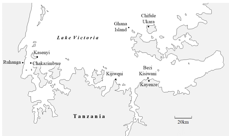
Figure 1 Map of study sites. Five island and three mainland communities were included in the study.

Our study was conducted in five island and three mainland fishing communities around the Tanzanian shoreline of Lake Victoria (figure 1). Of the estimated three million people living in Lake Victoria fishing communities, 12 approximately 60% are thought to reside within Tanzania. The fishing industry provides a major source of income for these communities, with men filling roles as boat builders, boat owners, crew and in fisheries management, and women processing and trading fish. Lake Victoria fishing communities are typically poor and have high rates of illiteracy. 14 Many have limited availability of services such as schools (particularly post primary education) and health facilities. Housing largely comprises temporary or semi-permanent structures, and often has no electricity supply; frequently, the lake is a household's main source of water. Land-based transport is typically on dirt roads, often by bicycle or motorbike; most community members do not own cars. Many lakeside fishing communities have a high prevalence of HIV/AIDS, 14 and other common health threats include malaria, bilharzia, tuberculosis, syphilis, typhoid and cholera.