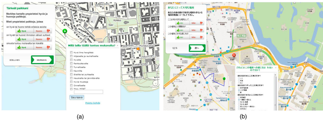
Figure 1. The softGIS survey platform used with Finnish (A) and Japanese (B) children. www.softgis.fi/children .

Yhtenäiskoulu schools from the city of Helsinki. Out of these 15 schools, eight had both elementary and secondary levels (i.e. school grades from 1 to 9), four were secondary schools (grades 7–9) and two elementary schools (grades 1–6). All children in grades 5 and 8 (approximately 11 and 14 years of age, respectively) were eligible to participate. The data were collected in all year 5 and 8 classes of participating schools during between 10/2011 and 2/2012. Data collection occurred in computer-equipped classrooms, led by a trained research assistant. The Ethics Board from the Education Board of the cities of Helsinki, Espoo and Vantaa approved the research, and informed consent was gathered from both the responding children and their parents.