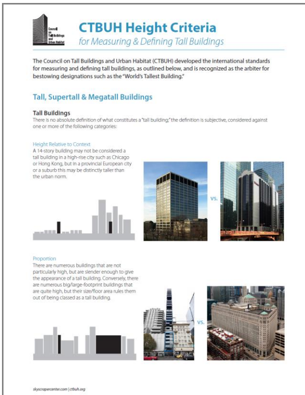
Figure 2: Currently silent on the subject of timber. The CTBUH Height Criteria for Measuring & Defining Tall Buildings available at www.ctbuh.org .

The generally accepted guidance on tall building classification and terminology is the CTBUH's Criteria for Defining and Measuring Tall Buildings [7]. These criteria provide comprehensive guidance in relation to the determination of height and building materiality for the conventional materials of tall building construction – steel and concrete – but are silent on the use of timber and other new materials.