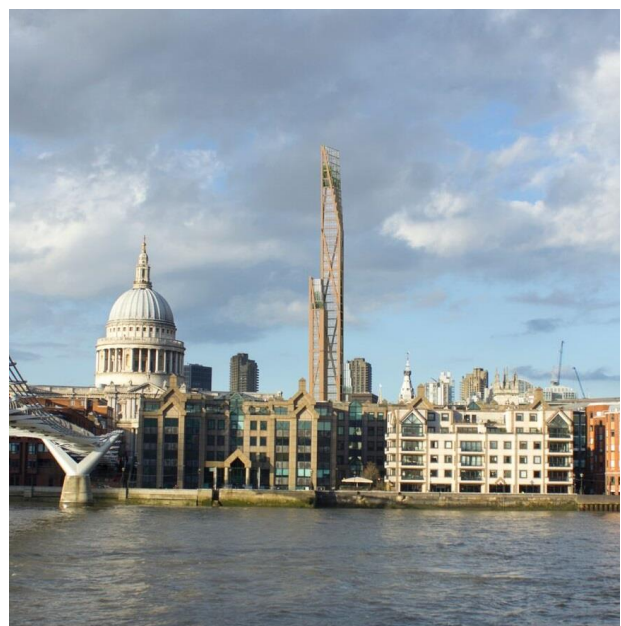
Figure 1: The 300m Oakwood tower concept for London. A vision for tall timber exists; but a formal definition does not. Image: PLP Architecture.

Defining and Measuring Tall Buildings [7] – criteria that currently include only steel and concrete as structural materials. This paper assesses the challenges associated with the extension of these existing criteria to timber and highlights a proposal as to how this can be achieved. Finally, this paper details the progress that has been made towards the inclusion of timber as a revision to the existing criteria.