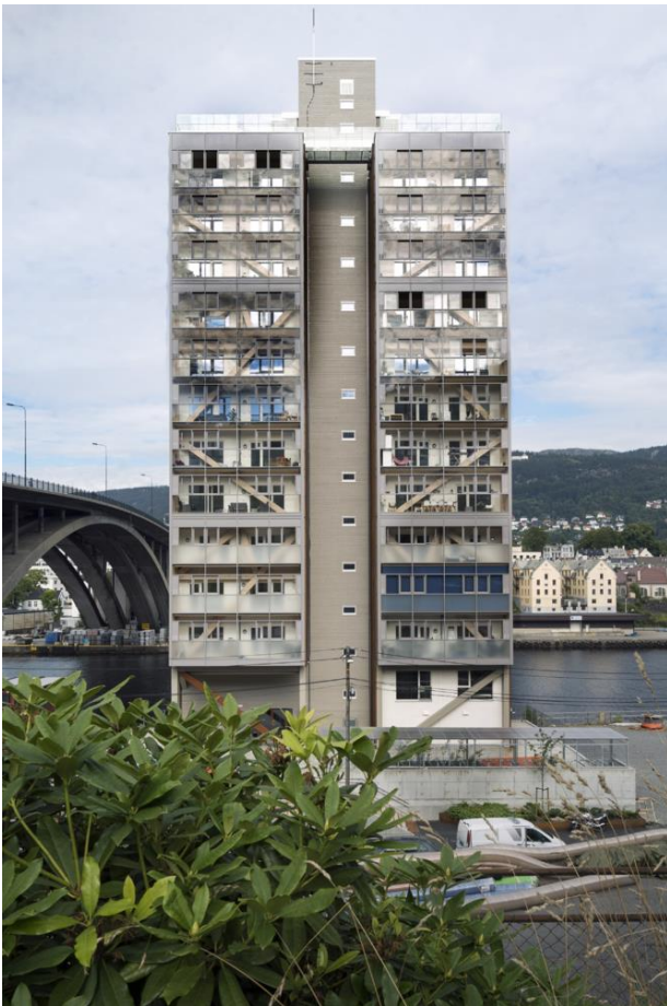
Figure 3: Tall timber? The 14-storey Treet building in Bergen, Norway.

These heights are measured from the finished floor level of the lowest, open-air pedestrian entrance leading to the main vertical transportation conduit. The height to tip measurement includes projections such as antennae that are not integral and may not be permanent features of the building. The height to architectural top or ‘gross’ height is the basis for the CTBUH list of World’s Tallest Buildings and is measured to the permanent top of the building. This includes features such as spires but excludes antennae. Building classifications of super- and mega-tall are based on this gross height (CTBUH 2009).