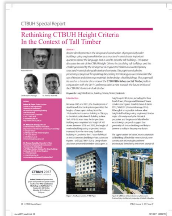
Figure 6: A proposal to update the CTBUH Criteria for Defining and Measuring Tall Buildings [13].

community of work in this area and setting out the proposal for consideration by the CTBUH Height and Data Committee . This proposal was also the subject of discussion at a Tall Timber Workshop preceding the 2017 CTBUH Conference in Sydney organised by the CTBUH Tall Timber working group co-chaired by the first author and Carsten Hein, ARUP. The proposal has also been submitted to the Chair of the Height and Data Committee for consideration as an amendment to the formal CTBUH Criteria and the first Author has been invited to attend a meeting of the CTBUH Height and Data Committee in October 2018 to discuss the proposal.