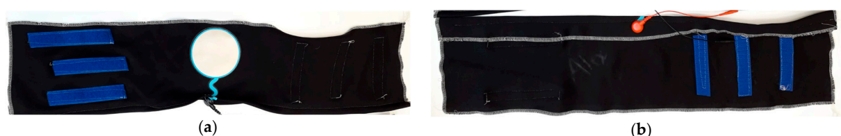
Figure 1. Images of the FES sleeve: (a) Front side with electrode and Velcro fastening; (b) Back side.

A compressive FES sleeve was developed; images are presented in Figure 1. Ease of usability of the FES garment was of great importance to this study as the intended end-user may have experienced spinal cord injury resulting in loss of movement in the lower half of the body. Therefore, design variables such as electrode placement, fastening system, and easy donning and doffing were optimised for these considerations.