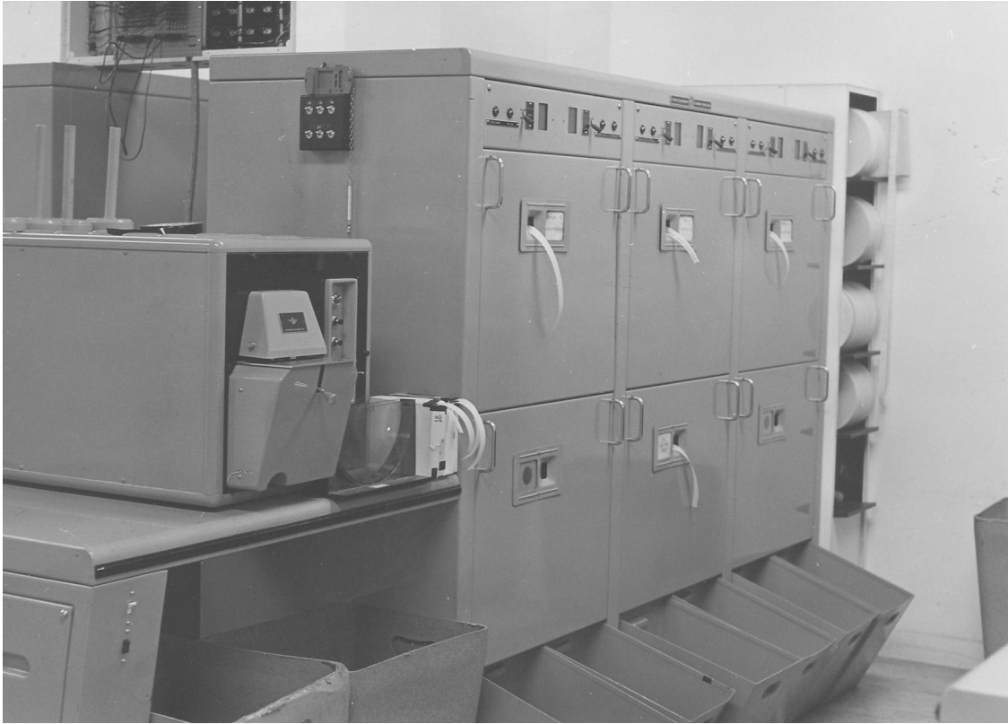
Figure 4: The communications bay showing the punches re-perforating paper tape transmissions from the branches, c. 1962.