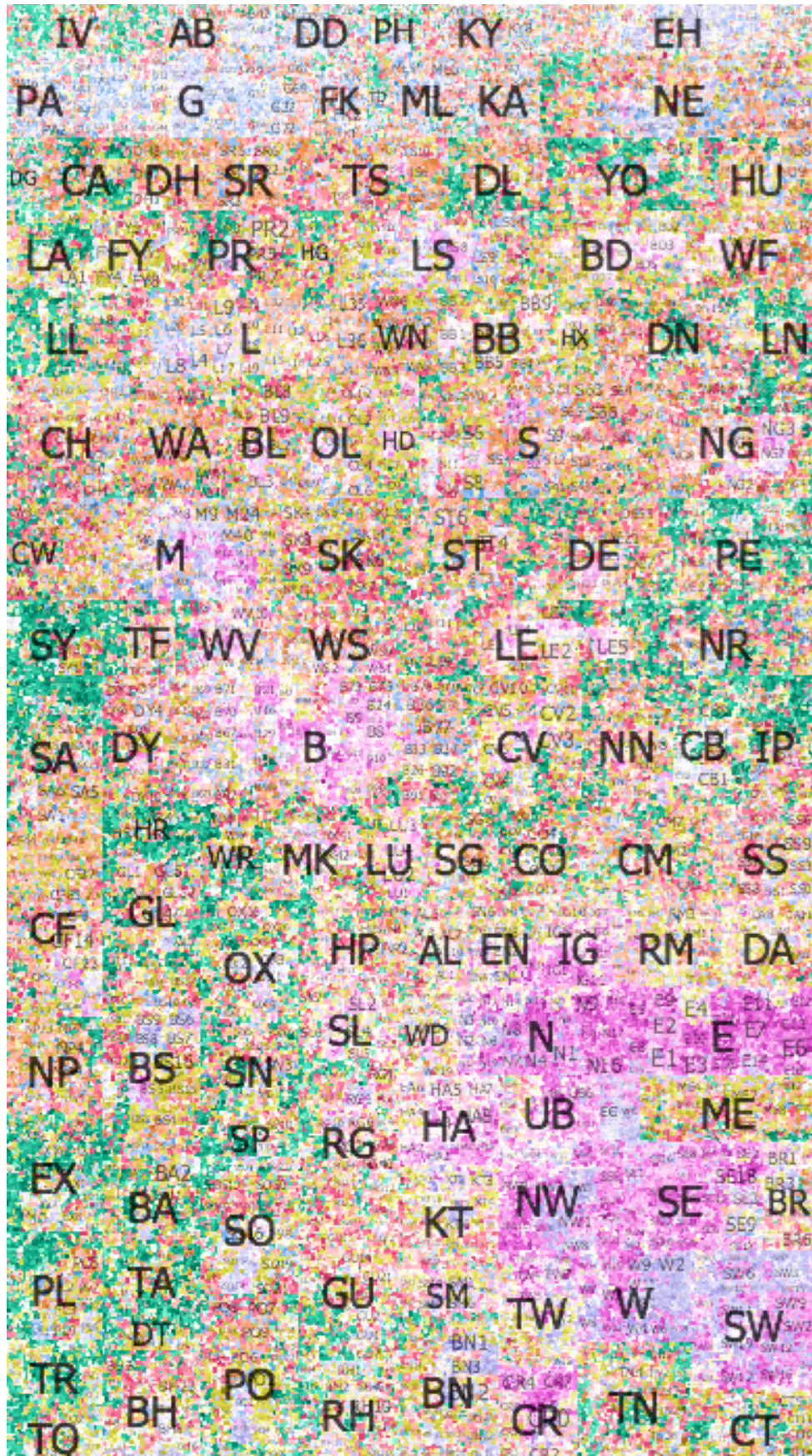
Figure 3. Output Areas sized by population within postcode using a rectangular hierarchical cartogram. Hue indicates OAC super-group (Table 1) and lightness indicates atypicality.