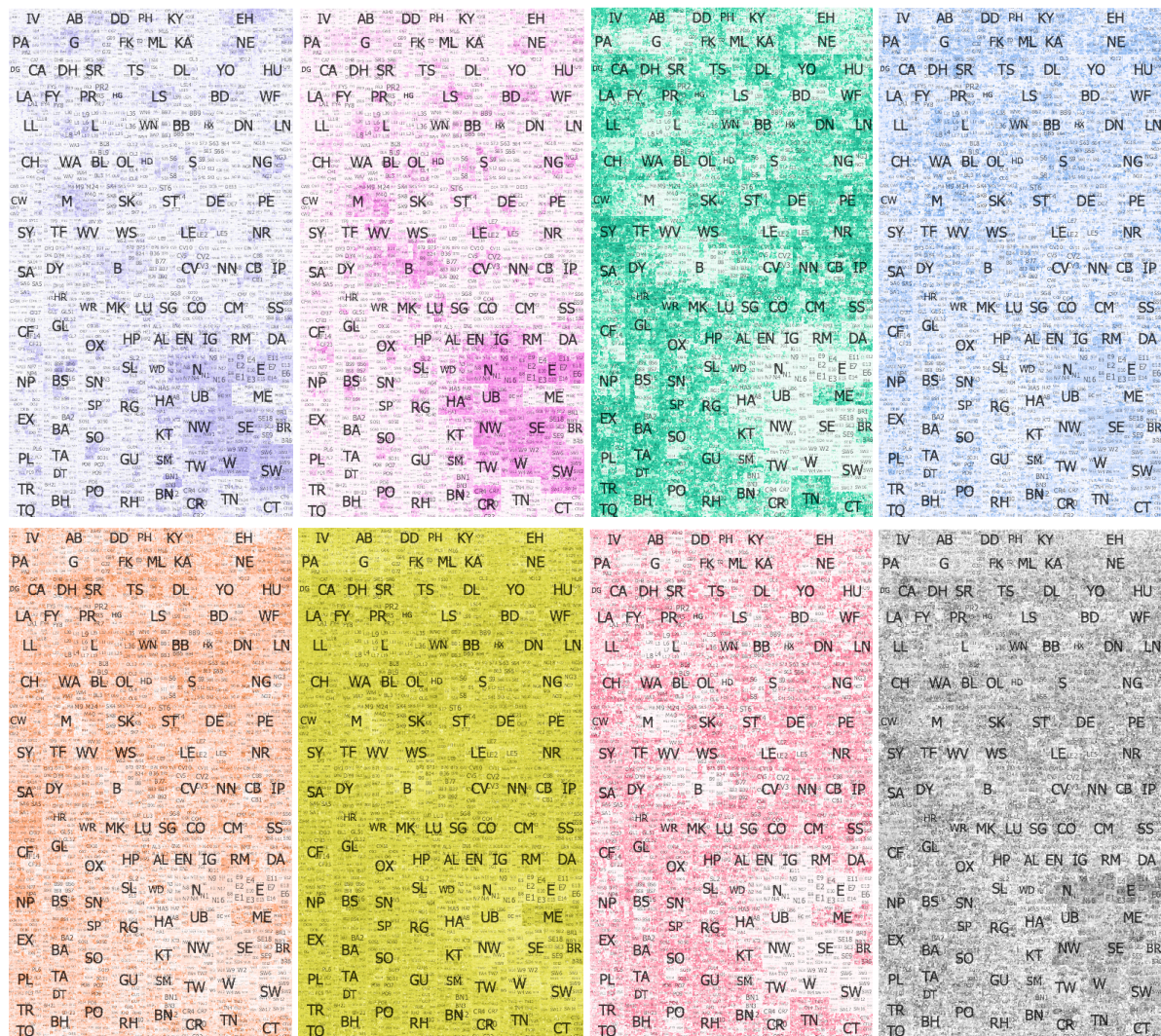
Figure 4. Similarity to specific super-groups (bottom right is similarity to closest, as Figure 3 but using lightness only to show typicality).

Mapping the similarity to each super-group individually is also interesting. Since lightness is comparable between the hues, direct comparison can be made: