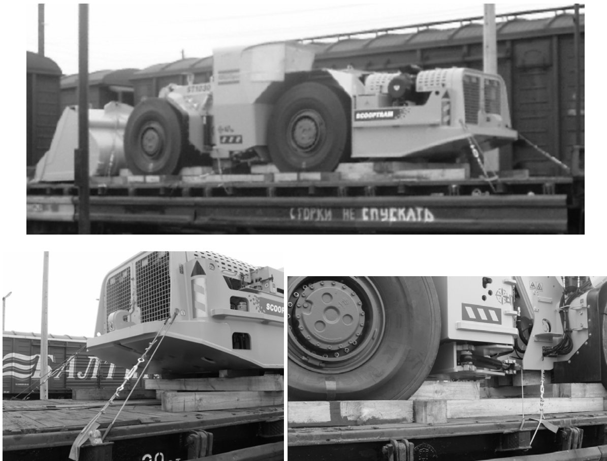
Fig. 1. Location and fixation of wheel vehicles on the wagon by flexible, thrust and supporting elements jointly with screw connection with right-hand and left-hand thread

In West-European countries and in America cargo is also fastened to the open rolling (wagons and motor transport) together with flexible (straps, cables, forged chains), thrust (thrust bars) and supporting (pads) fastening means (Fig.1) [3-5]. A distinguishing feature of these fastening means as compared to the Russian ones is the fact that fastening elements are the cables fixed to cargo and to a wagon frame by means of screw connection with right-hand and left-hand thread, Modulus of elasticity of these cables just as that of ordinary steel is equal to E = 2,1 \cdot 10^8 kN/m 2 (whereas modulus of elasticity of annealed fastening wires E is 20 times as little as ordinary steel, i.e. E = 1 \cdot 10^7 kN/m 2 ).