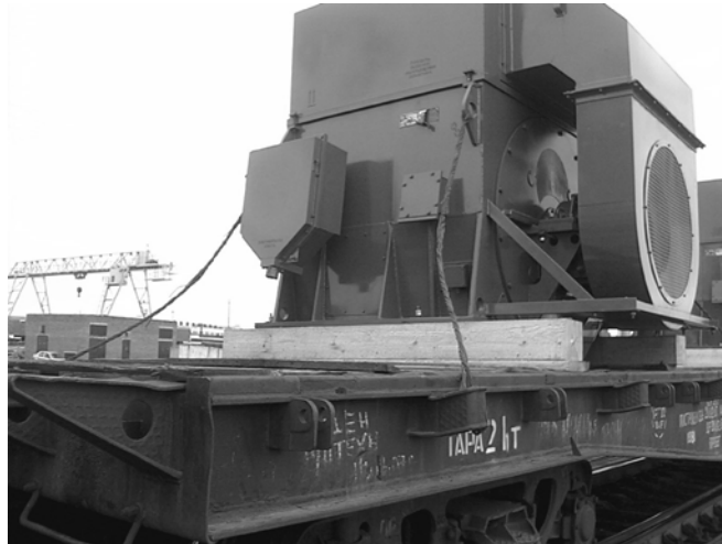
Fig. 2. Real model of cargo location and fastening in the wagon by means of flexible, thrust and supporting elements

Рис. 2. Реальная модель размещения и крепления груза на вагоне гибкими, упорными и опорными элементами