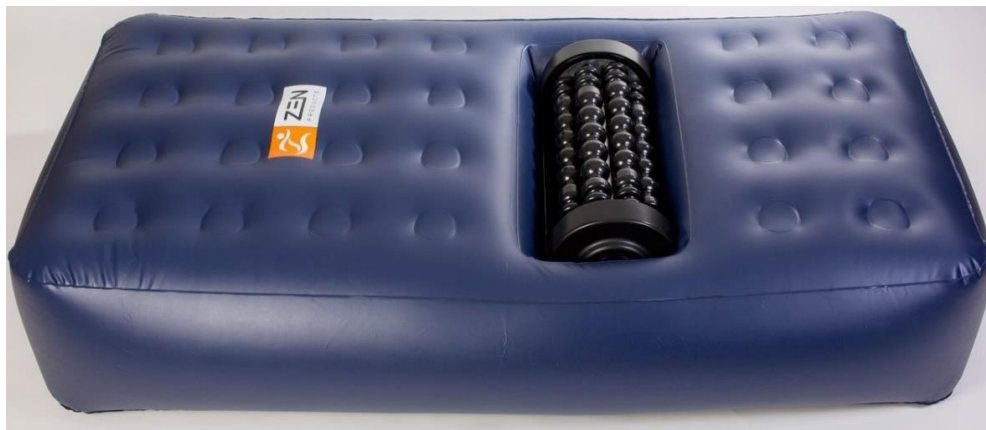
Figure 3. The Z-mattress placed over the Z-Roller.