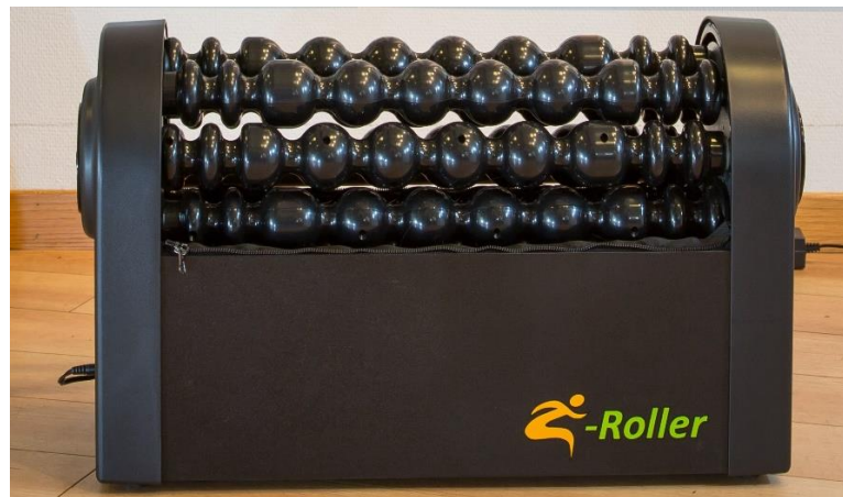
Figure 2. Z-Roller mechanical self-induced multi-bar roller-massager.