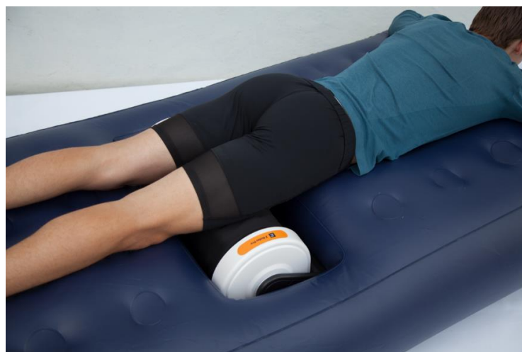
Figure 4. Participant laid face down on the mattress with the quadriceps muscle group placed on the Z-Roller.