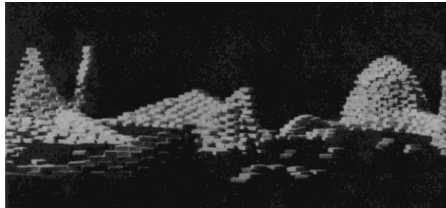
Fig. 1 Competition project „Biocity for Belgrade“, New Belgrade, 1965, Andrija Mutnjaković