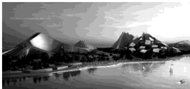
Fig. 2 Project „Zira Zero Island“, Azerbaijan, 2009, BIG