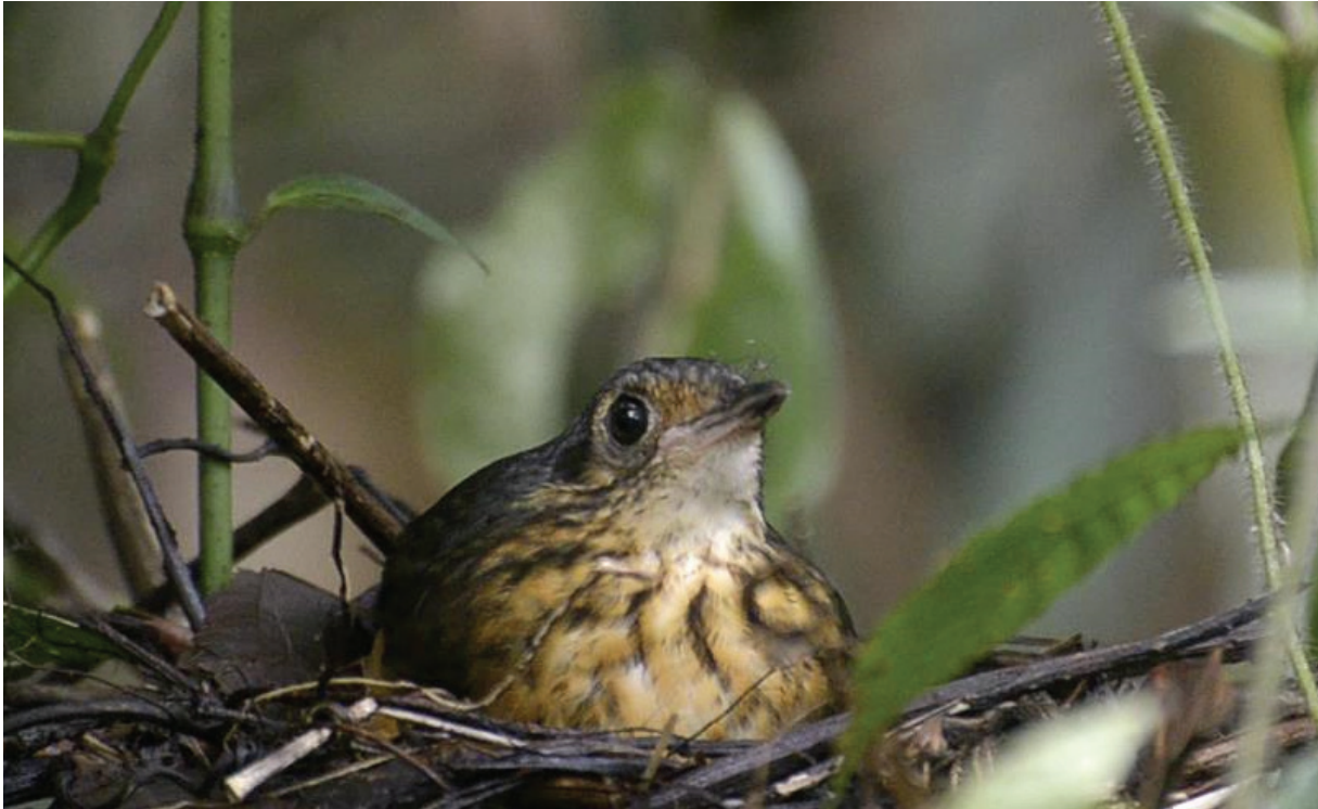
Figure 1. An adult Thicket Antpitta ( Hylopezus dives dives ) broods two nestlings in nest in Parque Nacional Volcán Arenal, Costa Rica, on 19 September 2012.