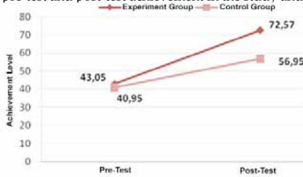
Figure 3. Pre-test and post-test results of concept attainment test for study and control groups

displays the results of pre-test and post-test achievement in the study and control groups.