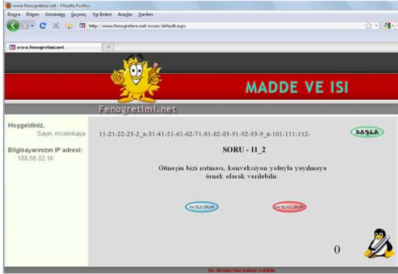
Figure 1. Web-supported alternative measurement tool question send interface

Flash CS4 program and the Adobe Dreamweaver CS4 Web editor. The Adobe Flash CS4 is widely used to create striking applications using videos, graphics and animations. It is one of the most advanced programs that facilitate working with both static and dynamic texts, transferring video and sound files, creating animations and other rich and interactive creative content environments. Besides producing both simple and high-speed animated designs, more advanced interactive animations are created with the help of Adobe Action Script. An image of the material is shown below: