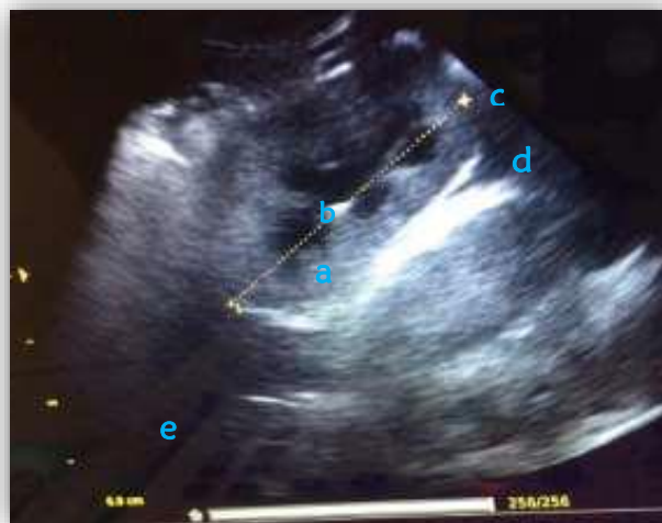
Figure 1. Ultrasonography (USG) investigations of domestic cats a) thickening of the renal cortex, b) renal medulla appeared small, c) kidney size 4.21 cm. d) capsules appeared hyperechoic. e) fluid accumulation in the abdominal cavity

Thickening of the renal cortex and renal capsules that appeared hyperechoic (Figures 1a and 1d), shows the existence of high echogenicity in the form of a collection of connective tissue (fibrosis) and added to the presence of inflammatory debris cells. According Wijayanti (2008), increased echogenicity can be caused by accumulation of oxalate crystals and tubular necrose. In Figure 1b, the renal cortex is thicker and the medulla looks smaller which shows that the kidney loses its normal structure, this can be caused by the formation of connective tissue in the kidney due to an inflammatory reaction. In Figure 1c, a line is drawn to determine the patient's kidney size, and size the kidney reaches 4.21 cm.