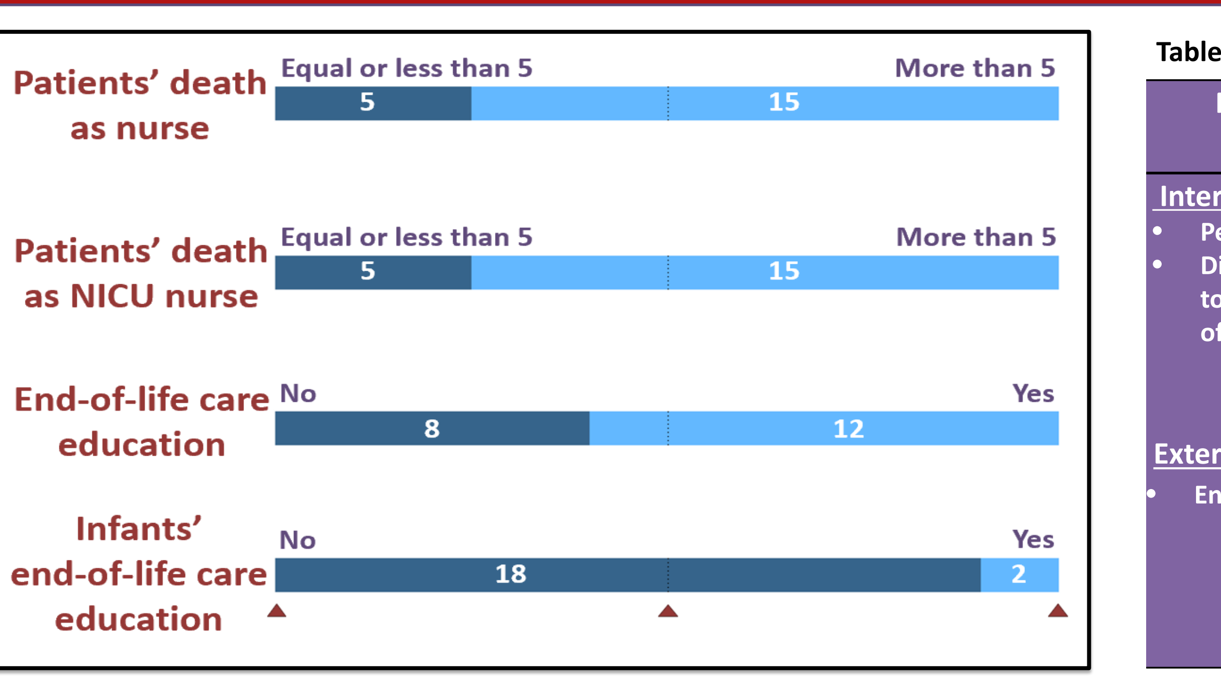
Figure 1. Characteristics of NICU nurses (Number = Frequency)