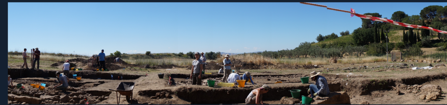
Panoramic view of archaeological fieldwork conducted by the American Excavations at Morgantina: Contrada Agnese Project