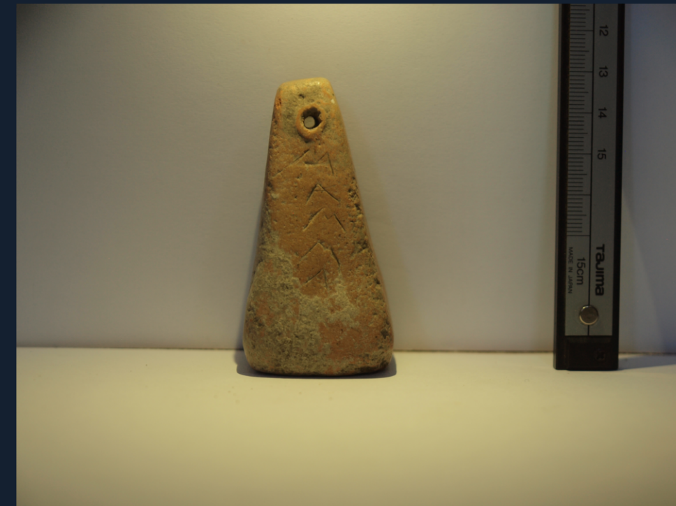
Loom weight from indigenous Sicilian settlement at Terravecchia di Cuti with inscription in Greek letters μημη ("Mother"?), 5th century BCE

*Department of History, College of Arts and Sciences, Seattle University