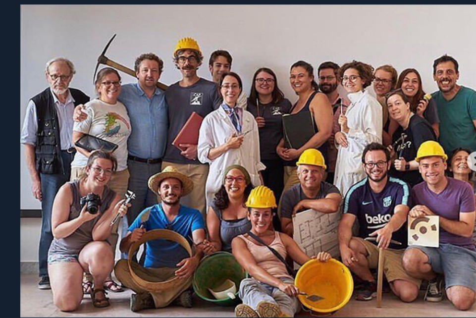
American Excavations at Morgantina: Contrada Agnese Project group photo 2019