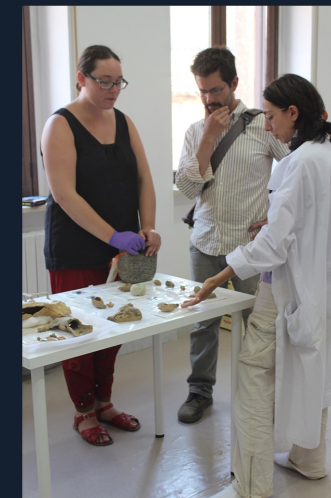
Working in the laboratory with AEM:CAP