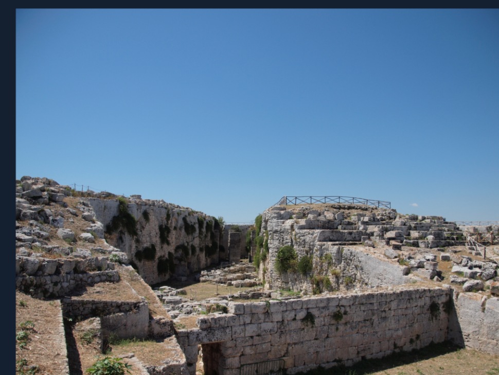
Syracuse, Euryalos fortifications with defensive ditch (center) and forward-projected guard tower (right), 4th-3rd centuries BCE under Greek control