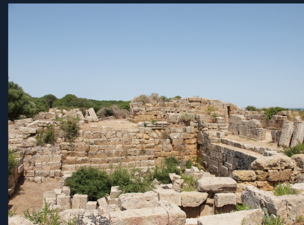
Selinunte, Porta Nord fortifications with defensive ditch (center) and forward-projected guard tower (background), 4th-3rd centuries BCE under Carthaginian control