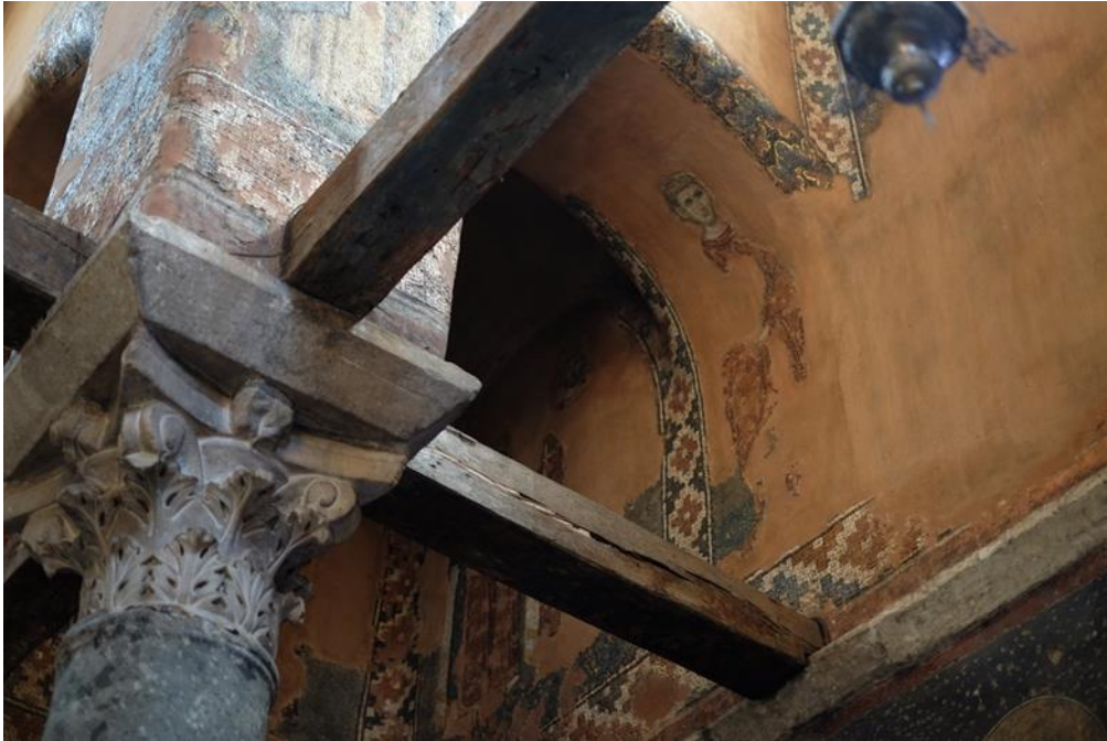
Fig. 3 Wooden tie beams, mosaics, and wall paintings, interior of Holy Apostles, Thessaloniki, c. early 14th century CE.

beams present at the Holy Apostles in Thessaloniki that revealed a firm date of 1329 CE, approximately ten years later than the date given in the dedicatory inscription. 14 (Fig. 3)