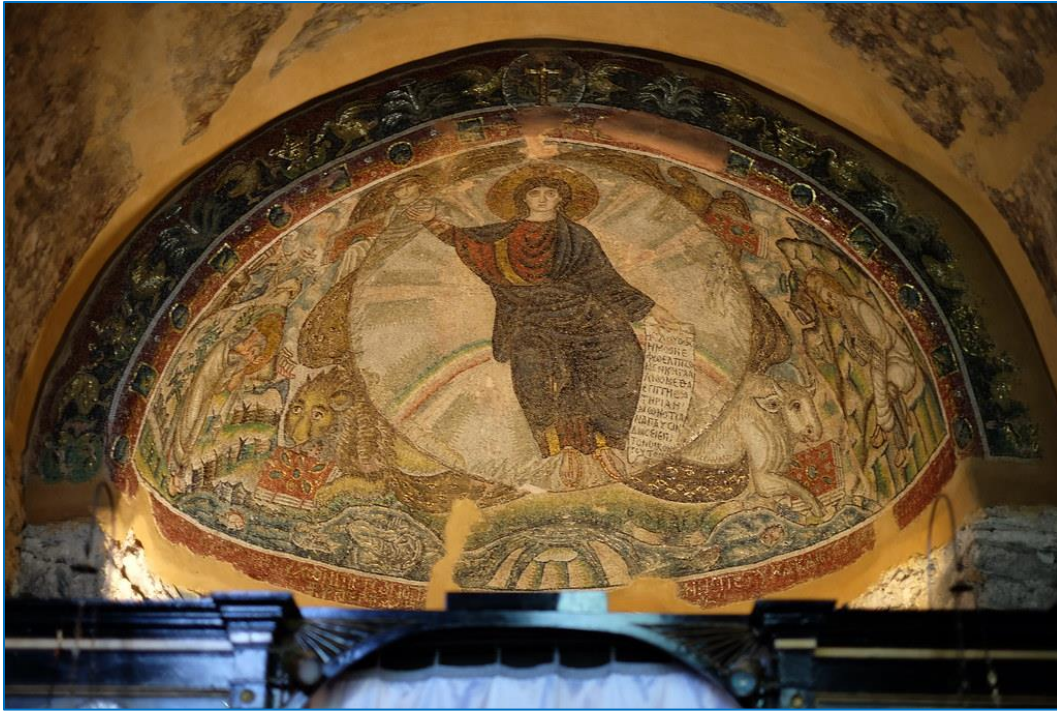
Figure 1 Apse Mosaic of Hosios David (Moni Latomou), Thessaloniki, c. 5 th century.

in human form, seated on a rainbow within an aureole of light supported by four winged creatures, which hovers above Earth,