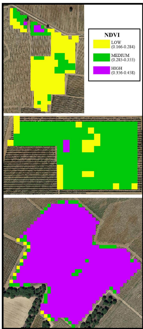
Fig. 3: NDVI classification between vineyards. 3 vigour levels: low, medium and high (top to bottom).

fermentation. Nutrients were added to the sowing and the addition was repeated at densities of 1070 and 1020 g·L -1 . At the end of the fermentation, a sulfitation was made and the temperature was reduced to 5 °C. Finally, the wine was decanted and kept at 6 °C until bottling.