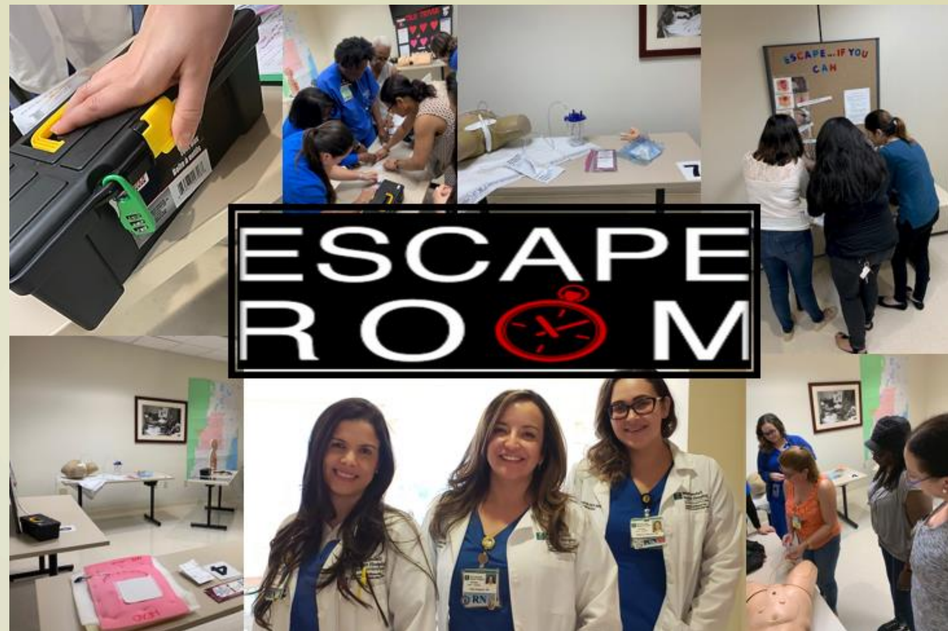
Figure 1. Nurses, clinical partners and CNEs participating in activity