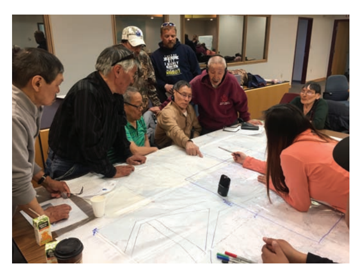
FIG. 2. Community members in Cambridge Bay, Nunavut, participating in a knowledge documentation workshop co-facilitated by local youth.

phone calls, and home visits). Research participants were not asked if they identified as Inuk. However, they articulated lifelong active engagement in local marine areas and most spoke Inuktut (the Inuit language). Discussions were conducted in English and Inuktut, simultaneously interpreted, and audio-recorded. Field notes were taken in English. Participants were remunerated for their time, as per local guidelines. During the workshops participants identified 1) wildlife habitat (e.g., feeding and breeding locations, migratory routes), 2) local harvesting and camping sites, 3) local travel routes, 4) potential impacts of marine vessel traffic, and 5) marine vessel-management options for the LISC specifically and local marine areas generally, for each season.