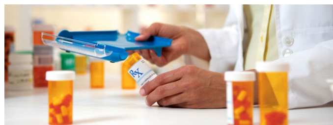
Figure 1. Graphical Abstract

The article aims to physico-chemical and economic considerations before compounding; factors and quality control issues; compounding support, training, chemical supplies, types of compounding (especially in hospital and ambulatory care compounding). It should aid to practice the extemporaneous preparation of basic and advanced formulations including pharmacopoeial and non-pharmacopoeial formulations encountered in pharmacy practice, together with requisite documentation, labeling, packaging and counseling requirements. Along with this, they have to study the analysis of formulations and their components and relate these to the clinical performance of medicines. This will help them to investigate, evaluate and report the physical characteristics of formulations including release kinetics and relate these to quality control and preformulation requirements; relate the application of quality control, quality assurance and the principles of good manufacturing practice to regulation of medicine production in home and abroad.