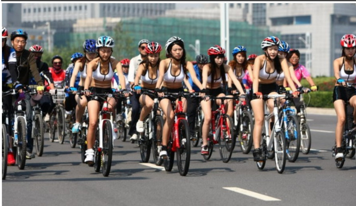
Figure 1: Cyclists ride in a campaign for low-carbon transport in Zhengzhou, capital of Henan province, which marked the World Car Free Day. [8]