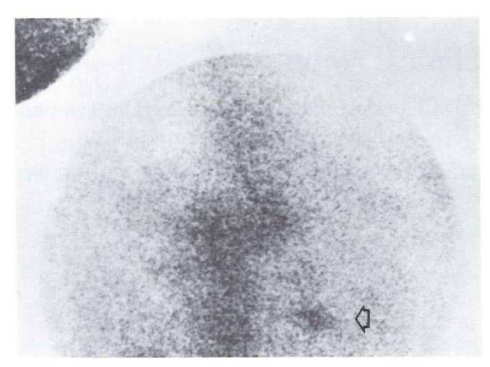
Fig. 3: <sup>67</sup>Ga Smaller, less intense area of activity is seen in region of the tumor (open arrow).

Subsequently, the patient had a <sup>67</sup>Ga citrate study, and routine 99m-Tc sulfur colloid images of the liver were made. The <sup>67</sup>Ga images were within normal limits except for a small area of activity to the left of the sternum (figure 3). This area also corresponds to the location of the tumor, although the size and intensity of the activity is less than is seen with <sup>201</sup>Tl. It is also possible that the <sup>67</sup>Ga findings are secondary to the recent biopsy rather than primary tumor activity. The liver/spleen images showed only minimally decreased activity in liver compared to spleen, but there were no specific findings.